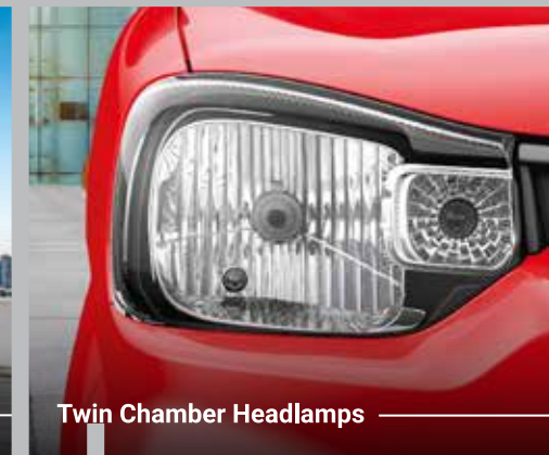
Twin Chamber Headlamps