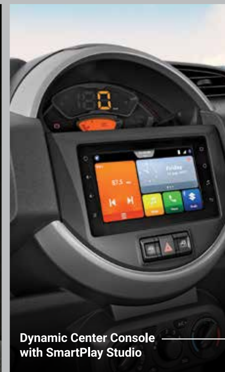
Dynamic Center Console with SmartPlay Studio