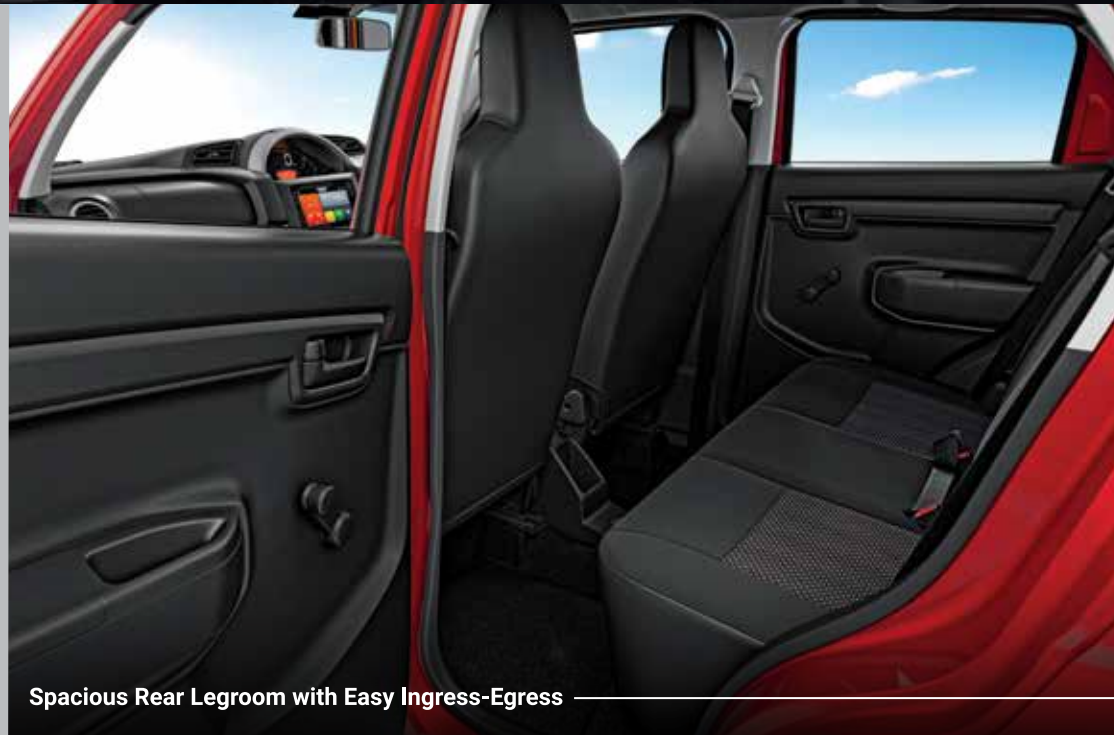
Spacious Rear Legroom with Easy Ingress-Egress