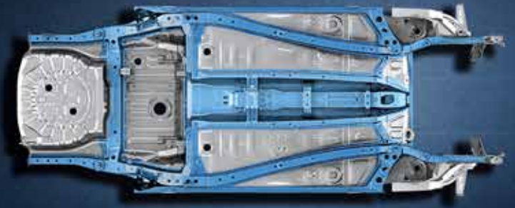
Strong Heartect Platform

*ISS is only available in Petrol variants.