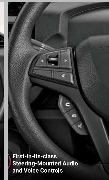
First-in-its-class Steering-Mounted Audio and Voice Controls