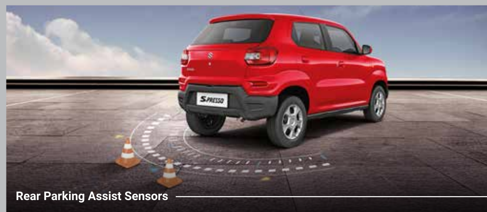
Rear Parking Assist Sensors