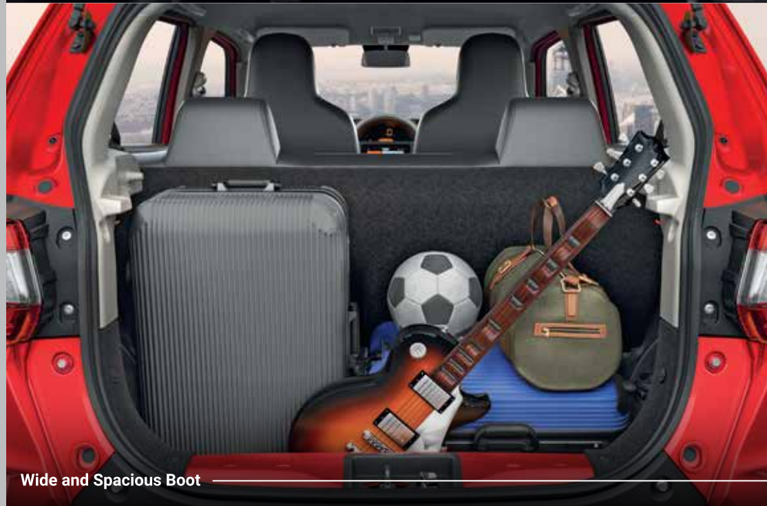
Wide and Spacious Boot

Open the doors and the S-PRESSO simply invites you to a world of never-ending excitement. All thanks to the commanding high-view seating that lets you scope the fun around you. Plus, its Dynamic Center Console, first-in-its-class Steering-Mounted Audio and Voice Controls and swanky colour accents make you feel alive, even before you drive out.