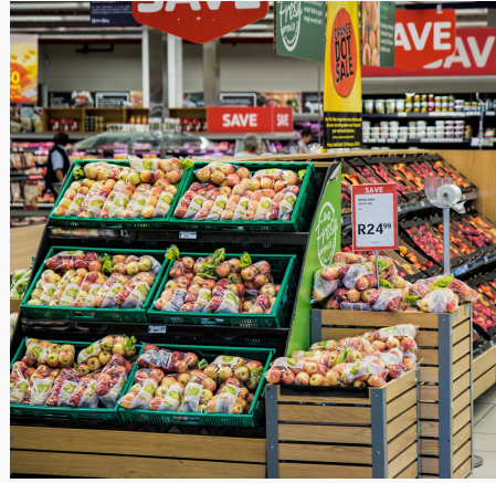
BUSINESS LOAN/ CASH CREDIT