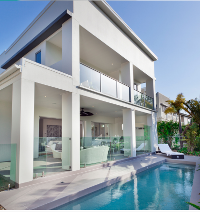
HOUSING LOAN/ LAP