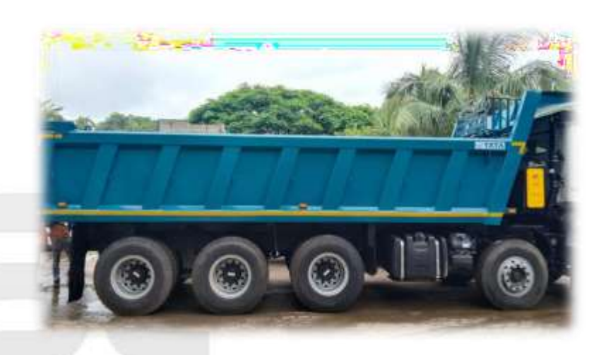
ASL GROUP OF COMPANIES