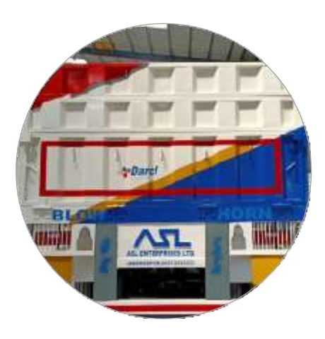
ASL Enterprises Ltd. Manufacturing Division