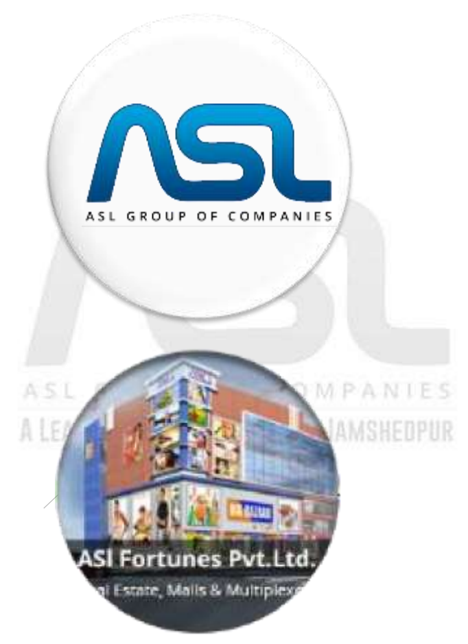
ASL Fortunes Pvt. Ltd.