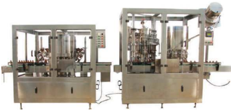
Rotary Washing & Monoblock Filling-Capping Machine