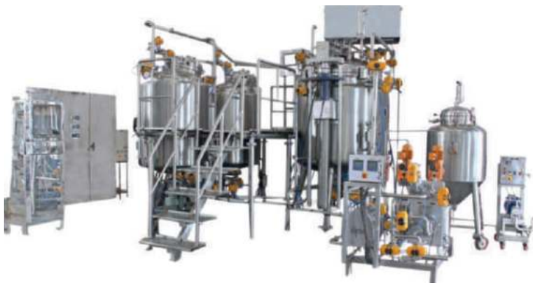
Ointment Manufacturing System