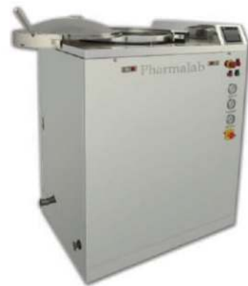
Vertical Drum Autoclave