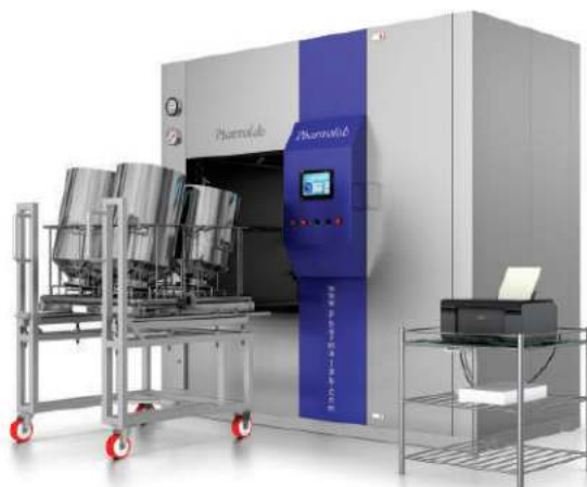
Multipurpose Pharmaceutical Washer