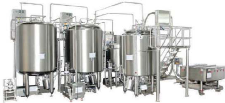
Three tank Liquid Oral Manufacturing