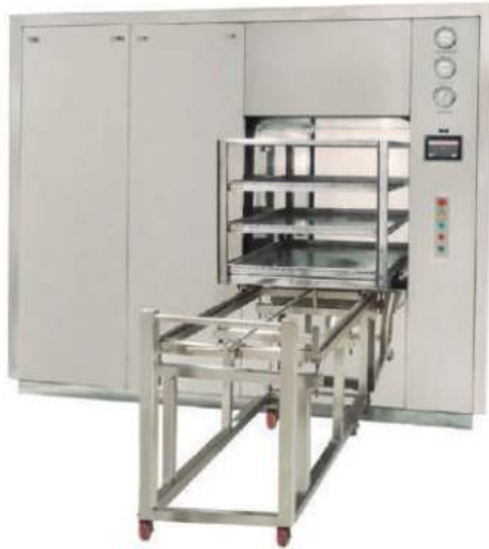
Steam Sterilizer (Horizontal Sliding Door)