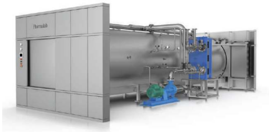
Super-Heated Water Spray Sterilizer