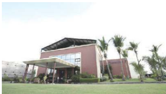
Manufacturing Plant at Santej, Ahmedabad