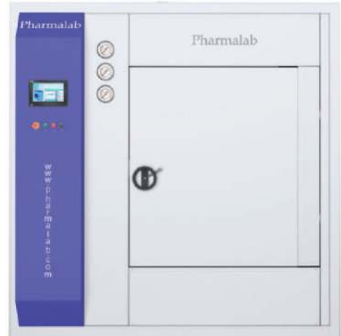
Steam Sterilizer (Hinge Door)