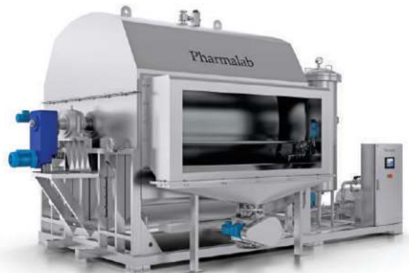
Rotary Vacuum Drum Filter