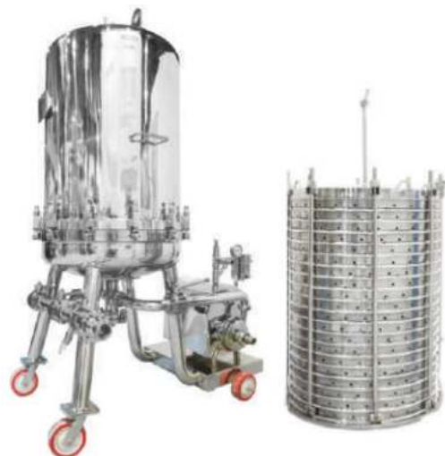
Filter Press with Cartridge Assembly