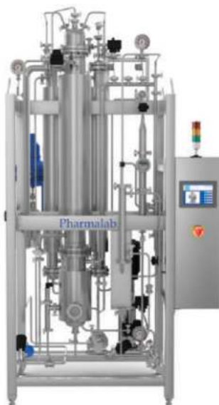
Pure Steam Generator