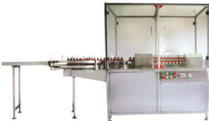
Airjet Bottle Cleaning Machine