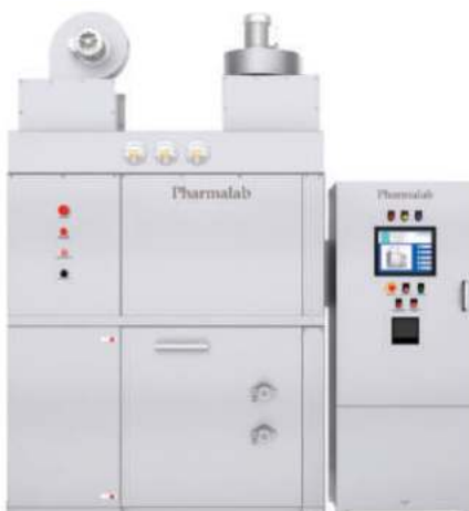
Dry Heat Sterilizer