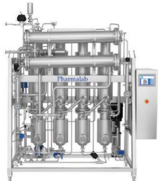
Multiple Effect Distilled Water Still