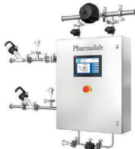
Point-of-Use (POU) System