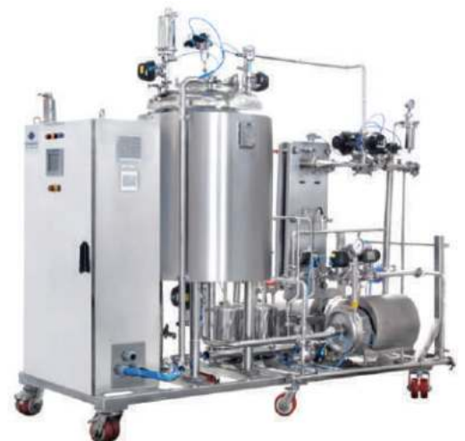
Mobile Automatic CIP/SIP System