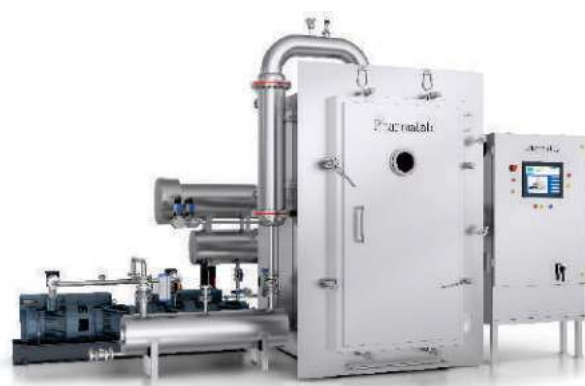
Vacuum Tray dryer