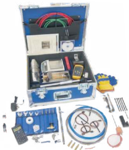
Pure Steam Testing Kit