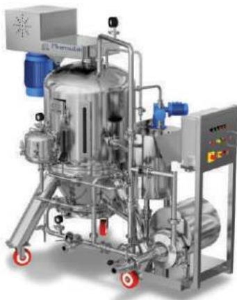
Automatic Horizontal Plate Filter