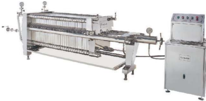
Plate and Frame Filter Press with Hydraulic Power Pack