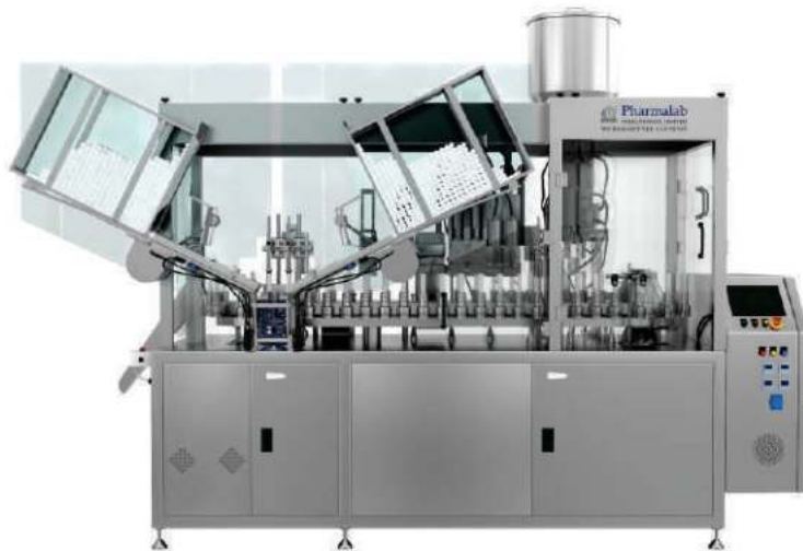
Double Head Tube Filling Machine