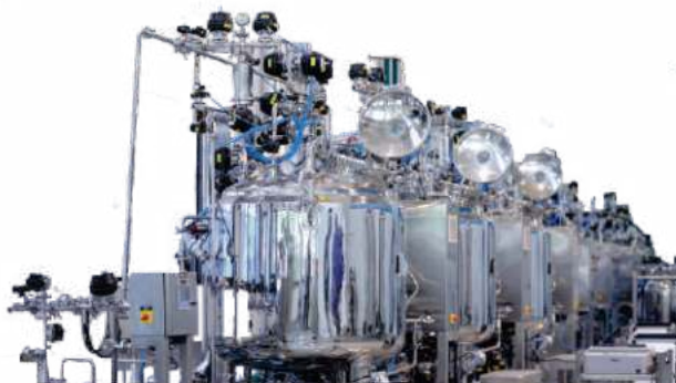
Aseptic liquid processing line