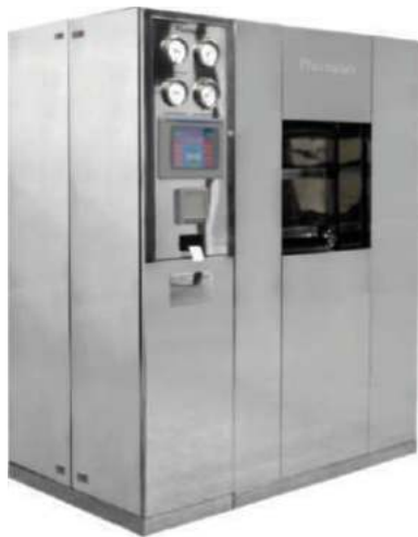
Steam Sterilizer (Vertical Sliding Door)