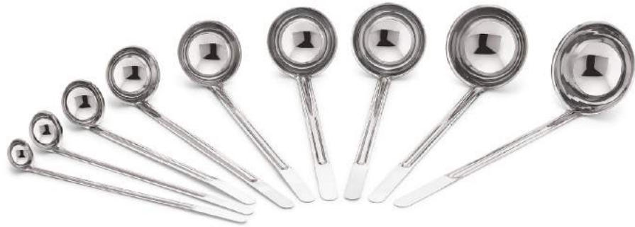
ONE PIECE LADDLE ( CAPCO )