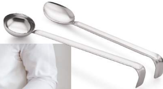
BUFFET LADDLE & BUFFET PAN