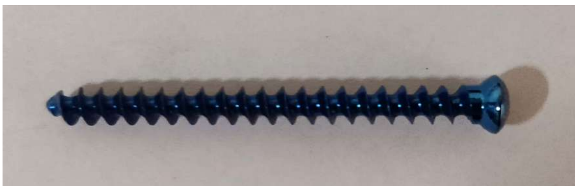
Cat No: 006.020T- 006.020 - 006.060T- 006.060 4.0 mm Cancellous Screw Full Thread (TiT/SS)- (20 -60 mm)