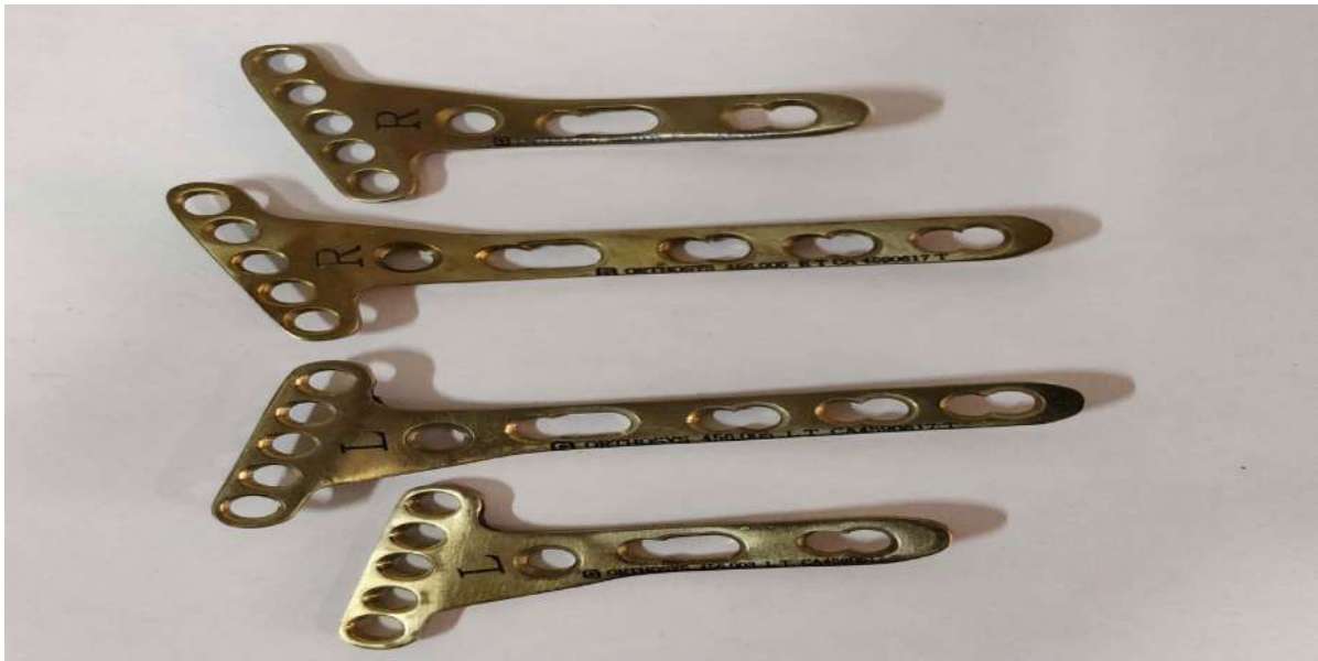
Cat No: 456.003 LT/RT /456.003 L/R - 456.005 LT/RT /456.005 L/R Distal Radius Volar LCP 5 H (Left /Right) 2.7 mm LCP (TiT/SS)- (3 -5 Holes)