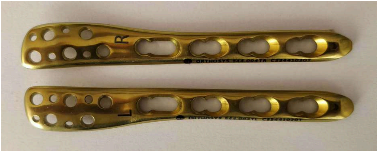
Cat No: 344.004 LT/RT /344.004 L/R - 344.010 LT/RT /344.010 L/R Lateral Distal Fibula (Left /Right) LCP (TiT/SS)- (4 -10 Holes)