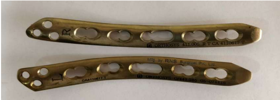
Cat No: 411.003 LT/RT /411.003 L/R - 411.009 LT/RT /411.009 L/R Medial Humerus Plate (Left /Right) 2.7/3.5 mm LCP (TiT/SS)- (3 -9 Holes)