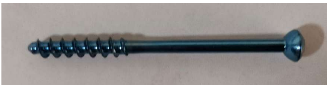
Cat No: 007.020T- 007.020 - 007.060T- 007.060 4.0 mm Cancellous Screw Part Threaded (TiT/SS)- (20 -60 mm)