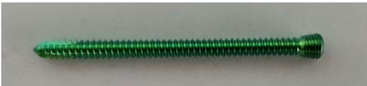
Cat No: 304.012T- 304.012 - 304.085T- 304.085 3.5 mm Locking Head Screw (TiT/SS)- (12 -85 mm)