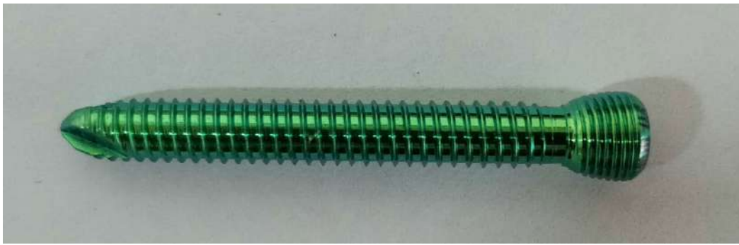
Cat No: 305.028T- 305.028 - 305.090T- 305.090 5.0 mm Locking Head Screw (TiT/SS)- (28 -90 mm)