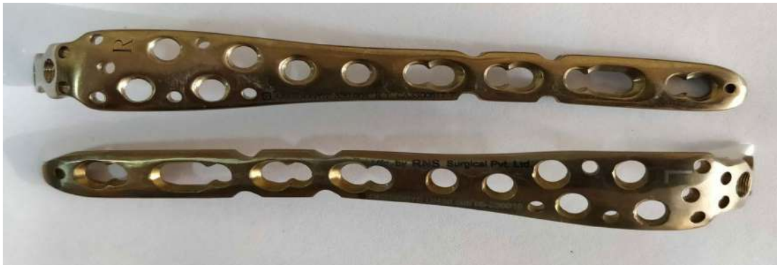
Cat No: 330.002 LT/RT /330.002 L/R - 330.008 LT/RT /330.008 L/R Olecranon Plate (Left /Right) 3.5 mm LCP (TiT/SS)- (2 -8 Holes)