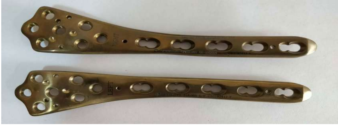
Cat No: 318.005 LT/RT /318.005 L/R - 318.013 LT/RT /318.013 L/R Distal Femur Plate (Left /Right) 4.5/5.0 mm LCP (TiT/SS)- (5 -13 Holes)