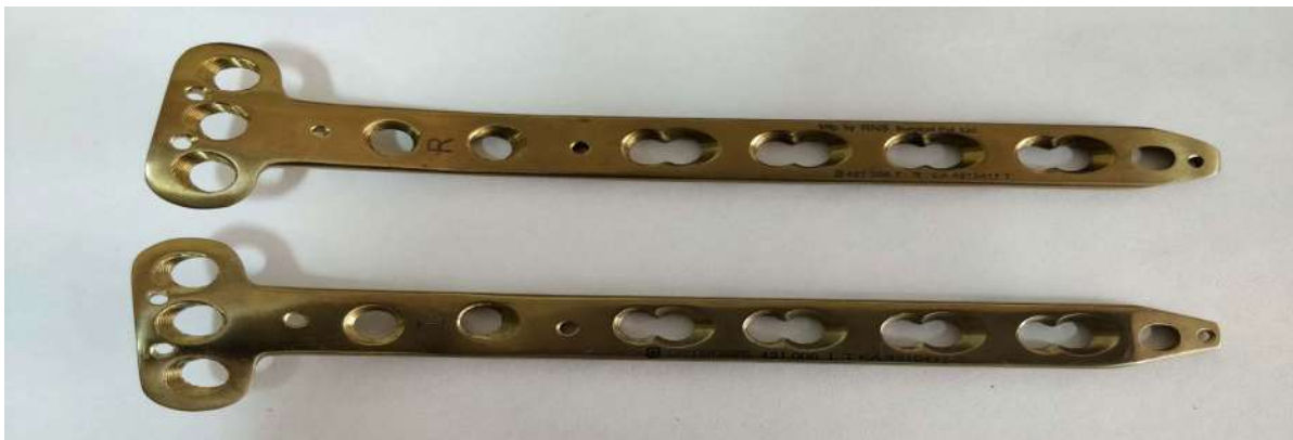
Cat No: 421.004 LT/RT /421.004 L/R - 421.010 LT/RT /421.010 L/R Medial Proximal Tibia Plate (Left /Right) 4.5/5.0 mm LCP (TiT/SS)- (4 -10 Holes)