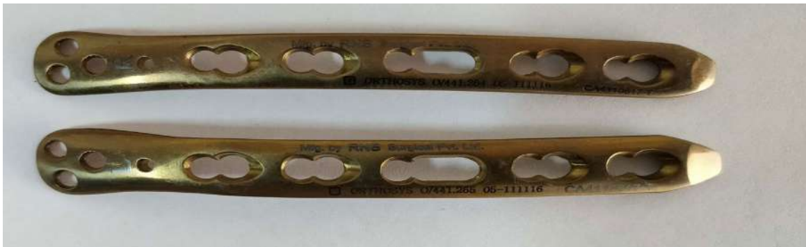
Cat No: 412.003 LT/RT /412.003 L/R - 412.009 LT/RT /412.009 L/R Dorsolateral Plate (Left /Right) 2.7/3.5 mm LCP (TiT/SS)- (3 -9 Holes)