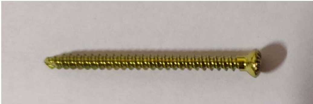
Cat No: 509.010T- 509.010 - 509.040T- 509.040 2.7 mm Cortical Screw (TiT/SS)- (10 -40 mm)