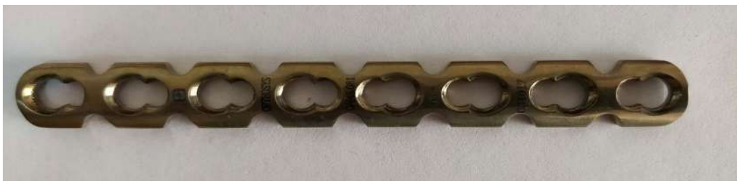
Cat No: 320.005T/320.005 - 320.012T/320.012 Lock-in Recon Combi Hole Plate 3.5 mm (TiT/SS)- (5 -12 Holes)