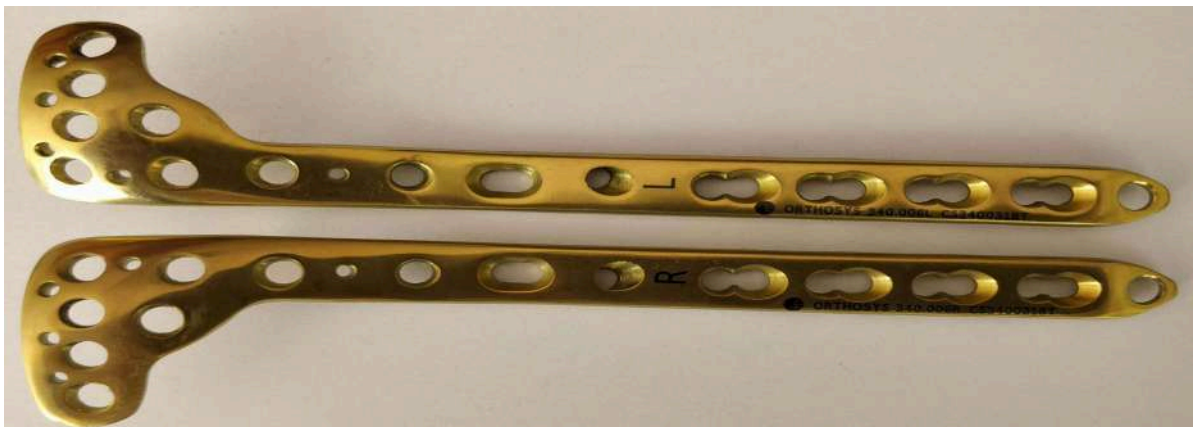
Cat No: 340.004 LT/RT /340.004 L/R - 340.012 LT/RT /340.012 L/R Proximal Lateral Tibia (O) (Left /Right) 3.5 mm LCP (TiT/SS)- (4 -12 Holes)