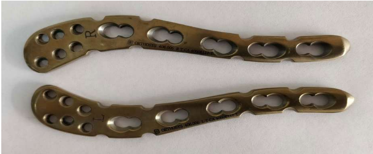
Cat No: 406.004 LT/RT /406.004 L/R - 406.006 LT/RT /406.006 L/R Clavicle Plate with Lateral Extension (Left /Right) 3.5 mm LCP (TiT/SS)- (4 -6 Holes)