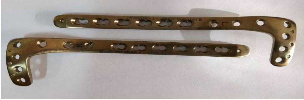
Cat No: 340.004 LT/RT /340.004 L/R - 340.012 LT/RT /340.012 L/R Proximal Lateral Tibia (Left /Right) 3.5 mm LCP (TiT/SS)- (4 -12 Holes)