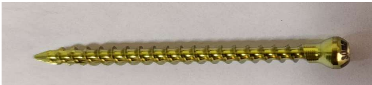
Cat No: 120.012T- 120.012 - 120.060T- 120.060 3.5 mm Cortical Screw (TiT/SS)- (12 -60 mm)