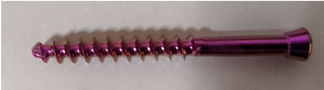
Cat No: 380.045T- 380.045 - 380.095T- 380.095 5.2 mm Cancellous Screw 32 mm TH (TiT/SS)- (45 -95 mm)