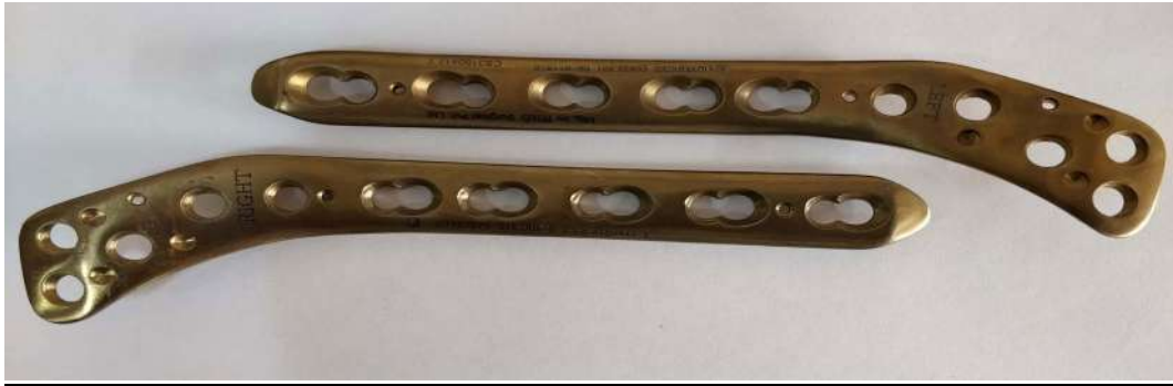
Cat No: 316.004 LT/RT /316.004 L/R - 316.013 LT/RT /316.013 L/R Lateral Tibia Plate (Left /Right) 4.5/5.0 mm LCP (TiT/SS)- (4 -13 Holes)