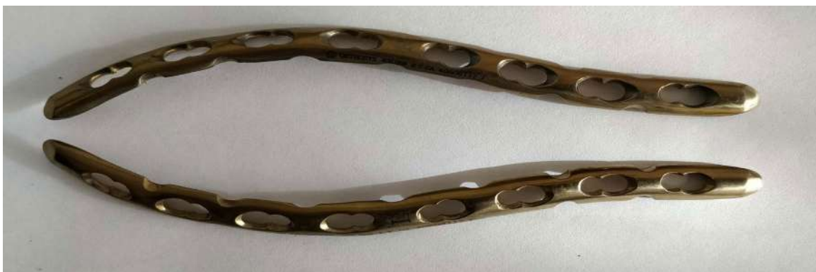
Cat No: 405.006 LT/RT /405.006 L/R - 405.008 LT/RT /405.008 L/R Superior Anterior Clavicle Plate (Left /Right) 3.5 mm LCP (TiT/SS)- (6 -8 Holes)