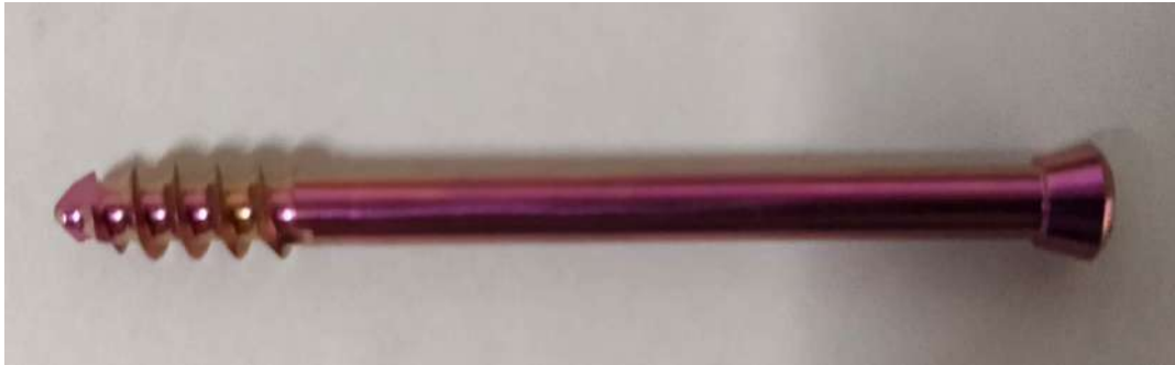
Cat No: 379.040T- 379.040 - 379.090T- 379.090 5.2 mm cancellous screw 16 mm TH (TiT/SS)- (40 -90 mm)