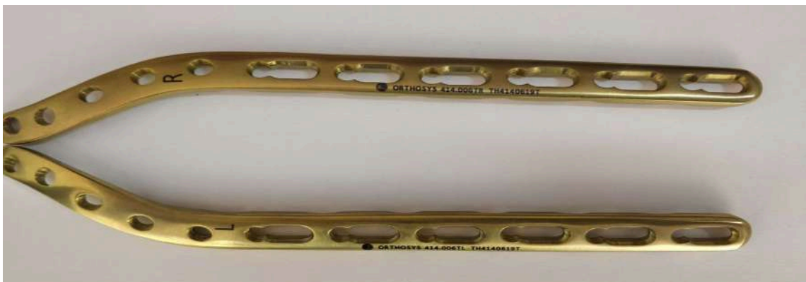
Cat No: 414.004 LT/RT /412.004 L/R - 412.010 LT/RT /412.010 L/R Distal Humerus EA Plate (Left /Right) LCP (TiT/SS) - (4 -10 Holes)