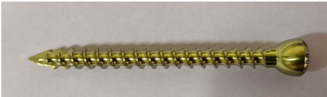
Cat No: 121.016T- 121.016 - 121.060T- 121.060 4.5 mm Cortical screws (TiT/SS)- (16 -60 mm)