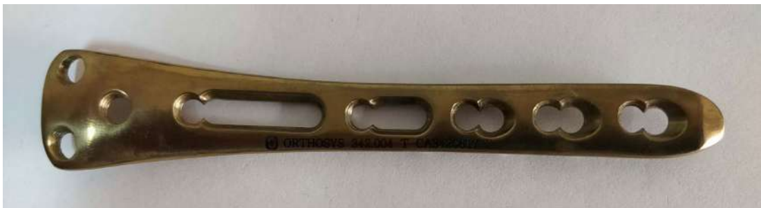
Cat No: 342.002T/342.002 - 342.008T/342.008 Posterior Medial Proximal Tibia Plate 3.5 mm LCP (TiT/SS)- (2 -8 Holes)