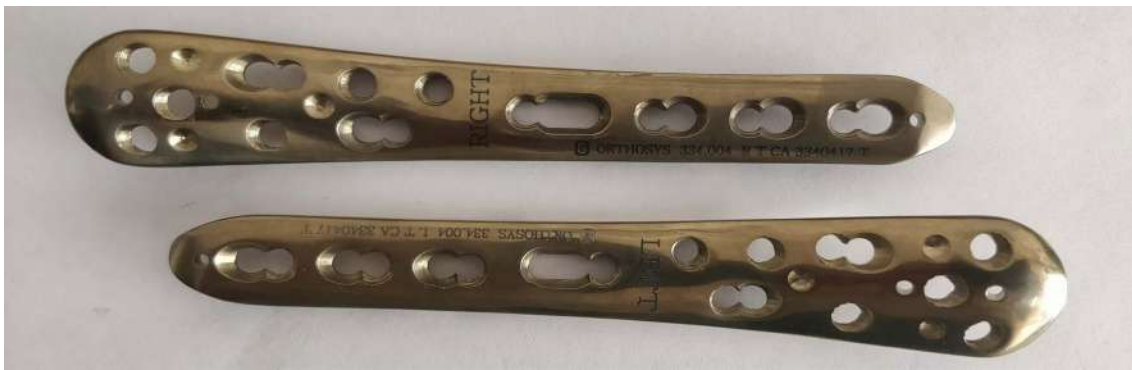
Cat No: 334.004 LT/RT /334.004 L/R - 334.014 LT/RT /334.014 L/R Distal Tibia Medial (Left /Right) LCP (TiT/SS)- (4 -14 Holes)