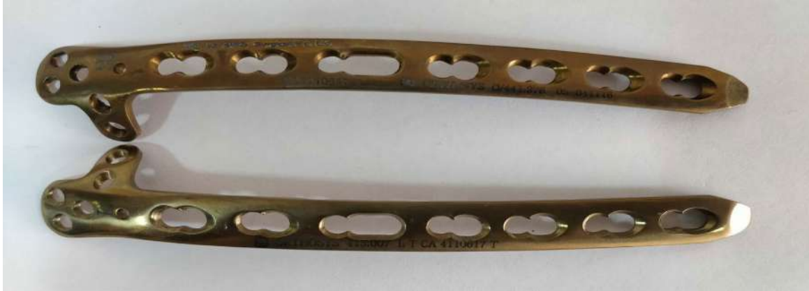
Cat No: 413.003 LT/RT /413.003 L/R - 413.009 LT/RT /413.009 L/R Dorsolateral Plate with Support (Left /Right) 2.7/3.5 mm LCP (TiT/SS)- (3 -9 Holes)