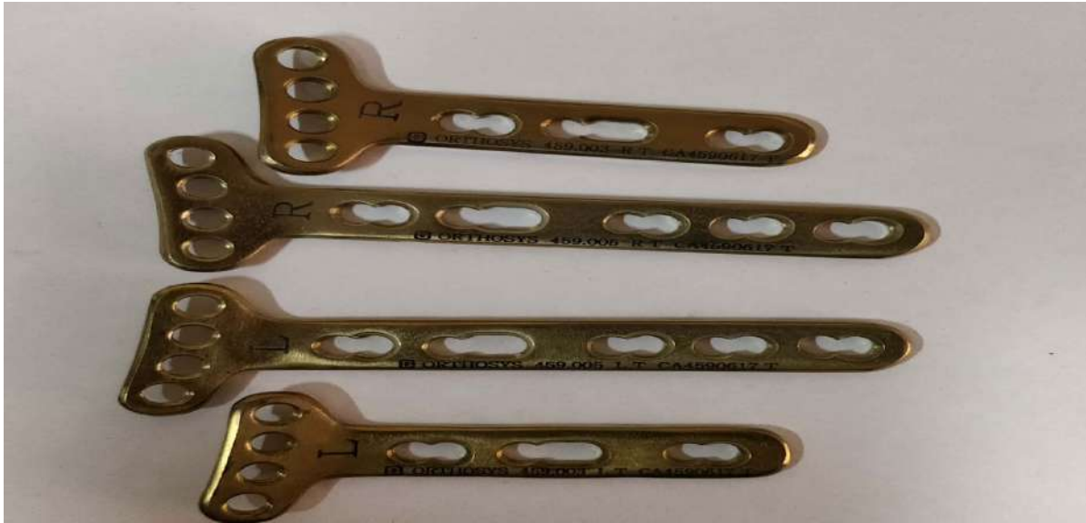
Cat No: 459.003 LT/RT /459.003 L/R - 459.005 LT/RT /459.005 L/R Distal Radius Volar EA 4 H (Left /Right) 2.7 mm LCP (TiT/SS)- (3 -5 Holes)