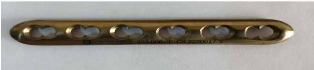
Cat No: 323.005T/323.005 - 323.012T/323.012 1/3 Tubular Plate 3.5 mm LCP (TiT/SS)- (5 -12 Holes)