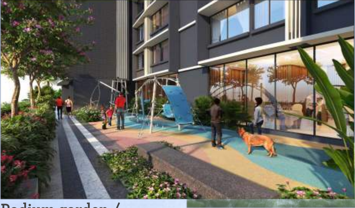
Podium garden / Kids play area