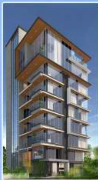
Aikya Eklavya House Location- Malabar Cumbala Hill Rera No- P51900032290