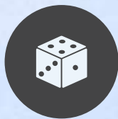
Indoor games room