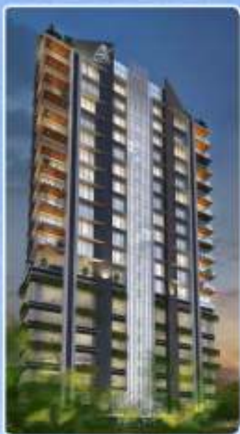
Aikya Signature Location- Tardeo Rera No- P51900002496