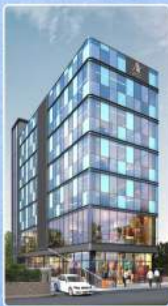
Golden Oak by Aikya Location- Vikhroli West Rera No- P51800047194