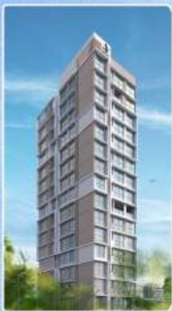
Aikya Heights Location- Byculla Rera No- P51900026085