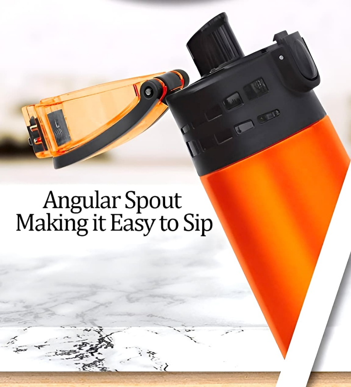
Angular Spout Making it Easy to Sip