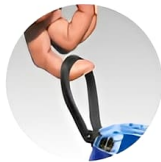
EASY TO CARRY WITH COMFORTABLE