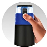
PUSH BUTTON TO OPEN LID FLAP