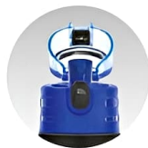
EASY TO SIP SPOUT