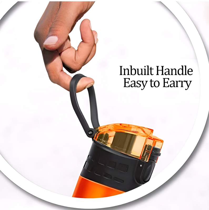
Inbuilt Handle Easy to Carry