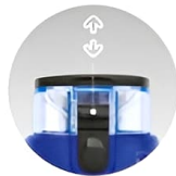
LID LOCK SYSTEM SLIDE DOWN TO LOCK.