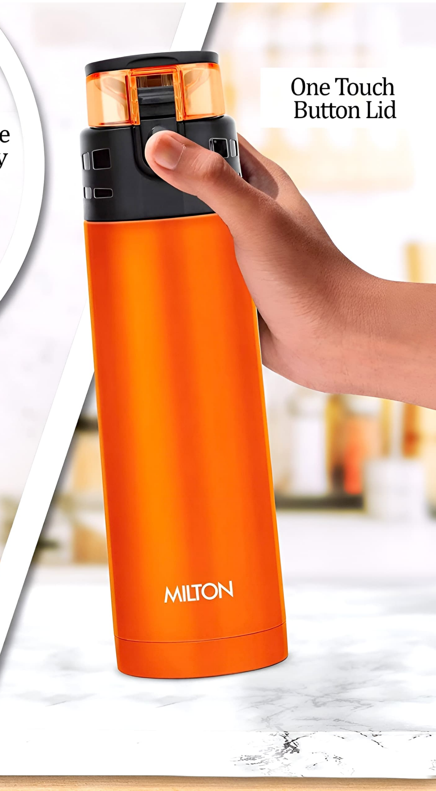
One Touch Button Lid