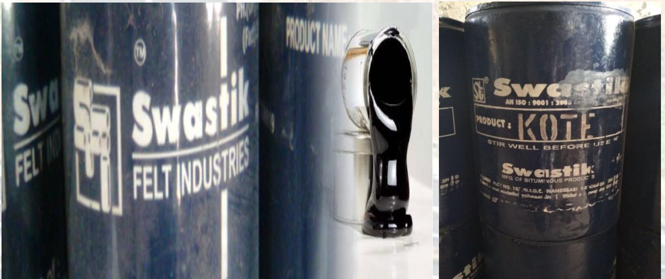
SWASTIK SEALING COMPOUND