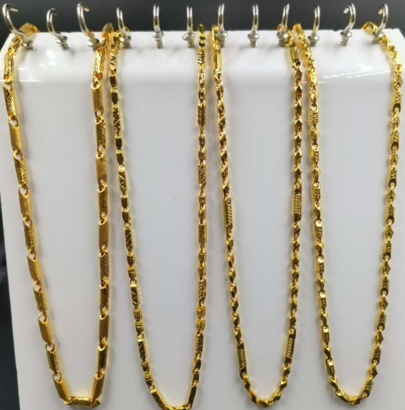
15 gm choco chains