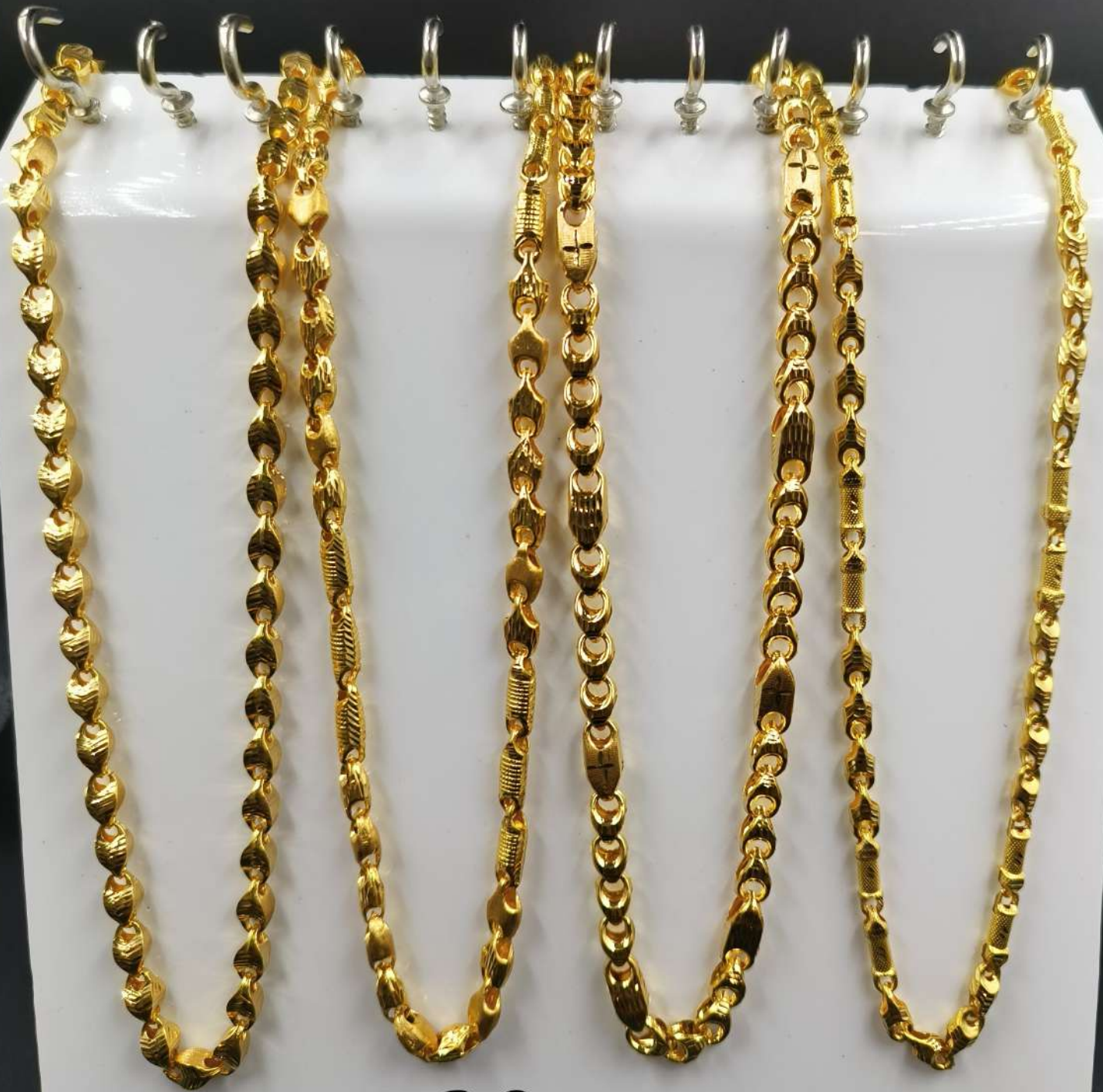
20gm choco chains