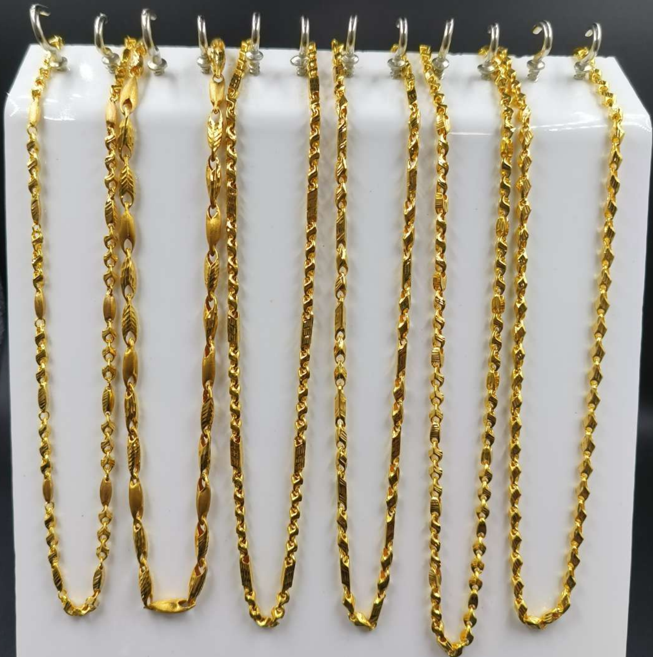
12-13 gm choco chains