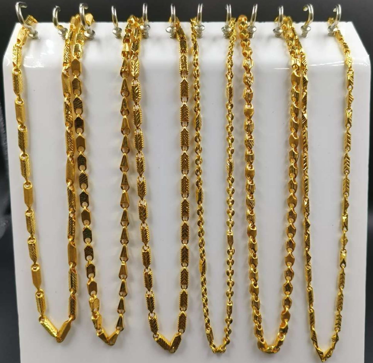
13-14Gm choco chains