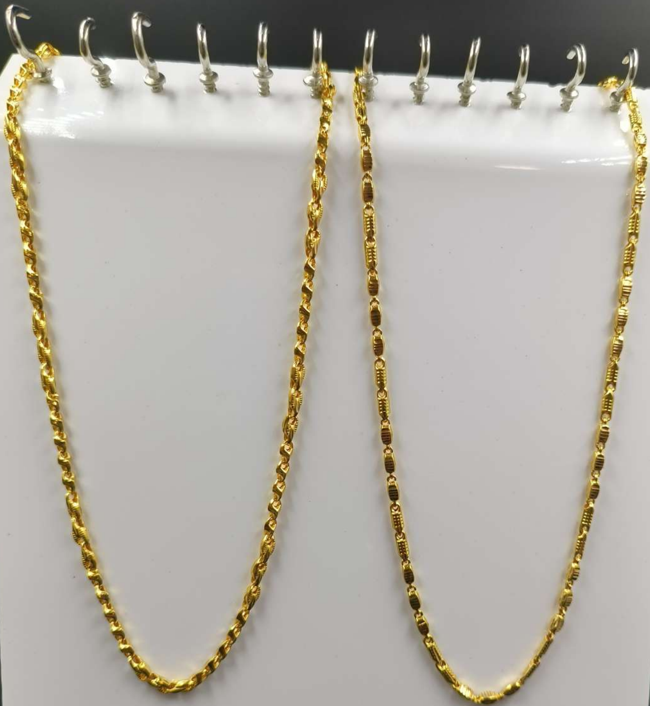
13-14 gm choco chains