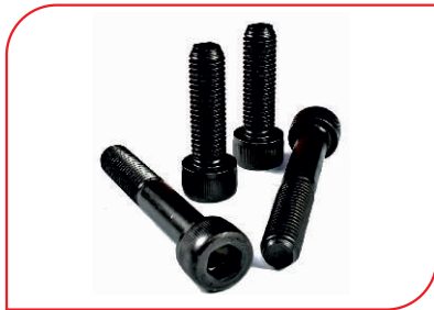
SOCKET HEAD CAP SCREWS