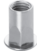
Half Hex Big