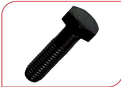
HIGH TENSILE HEX BOLT