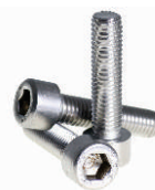
Allen Cap Screw