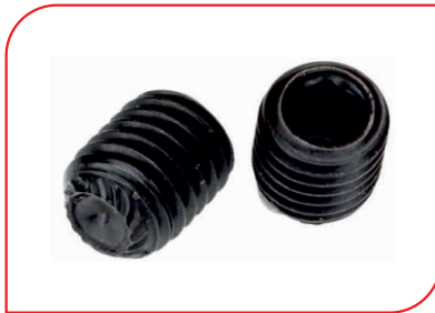
SOCKET SET SCREWS KNURLED CUP POINT