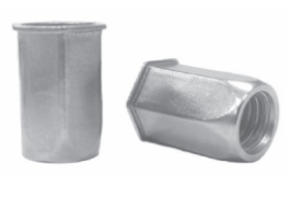
Full Hex Small