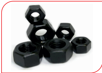
HIGH TENSILE HEX NUTS