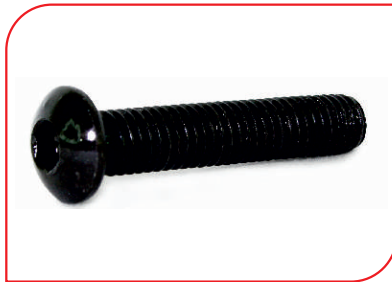
SOCKET BUTTON HEAD SCREWS