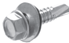
Hex Head SDS