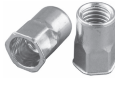
Half Hex Small