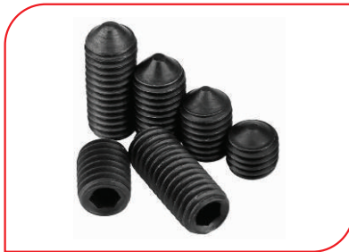
CONE POINT GRUB SCREW