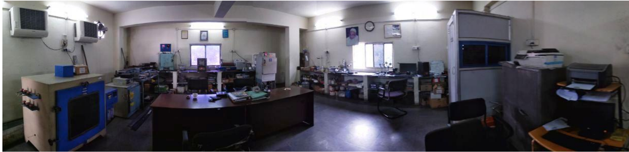
NABL ISO/IEC 17025-2017 accredited In-house lab (Mechanical & Chemical)