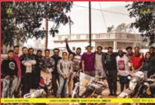
Launch Event - Academy of Motorcycling - Mumbai