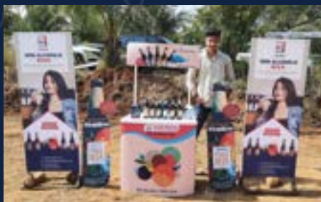
Promo Table & Standees