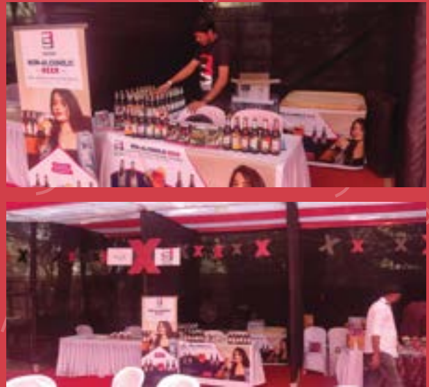
TEDxRambaug 2022 - Kalyan