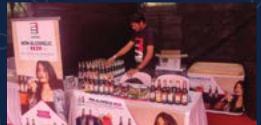
Banners & Posters