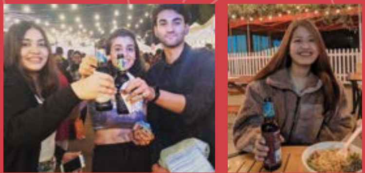
Local Food Fest 2022 - Raipur