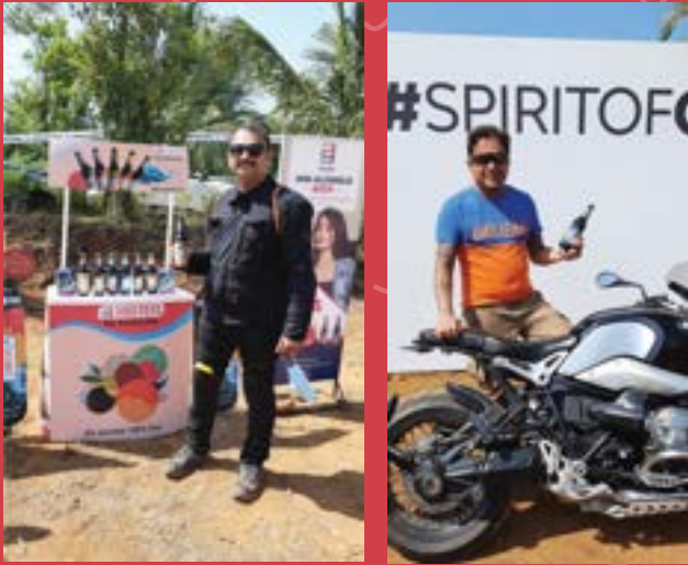
BMW GS Trophy Qualifiers 2022 - Karjat