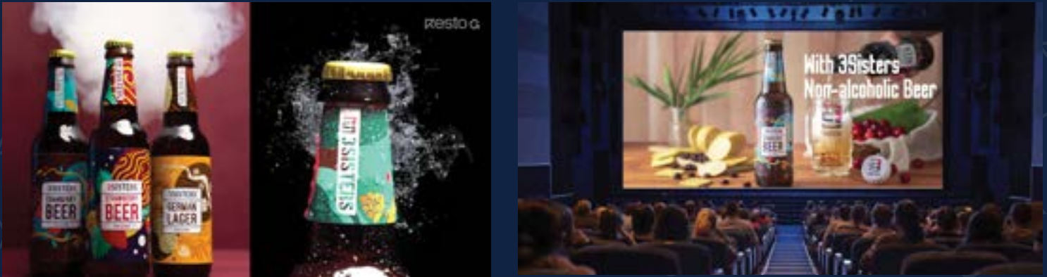
Video Marketing & Cinema Advertising

Creating brand recall through online & offline assets