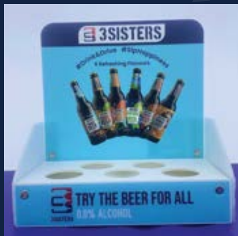
Counter-Top Display Asset (Retail)