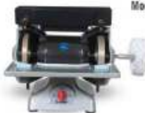
Model No. 11-12