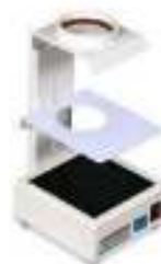
Progressive Mark Finder L2R1PMF1