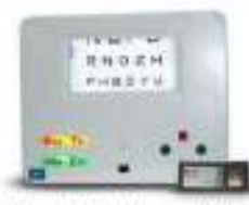
Distance Vision Drum with Remote L2R1DV01