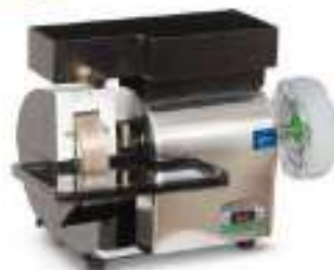
Model No. 8

Master Edger comes with dual wheels. One roughhand the other smooth with a bevel (V) groove, to satisfy your every need.