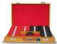
Premium Trial Set (RB02)