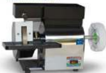
Model No. 2 - Std.

A fitter's No. 1 choice. India's most successful and trusted hand edger for over 30 years. Our grinding wheels give an unmatched quality along with long life. Popular, Groovomatic, Master and Auto Friend family of edgers comprise of 12 different models to satisfy your every edging need.