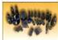
Drill / Generator Tool