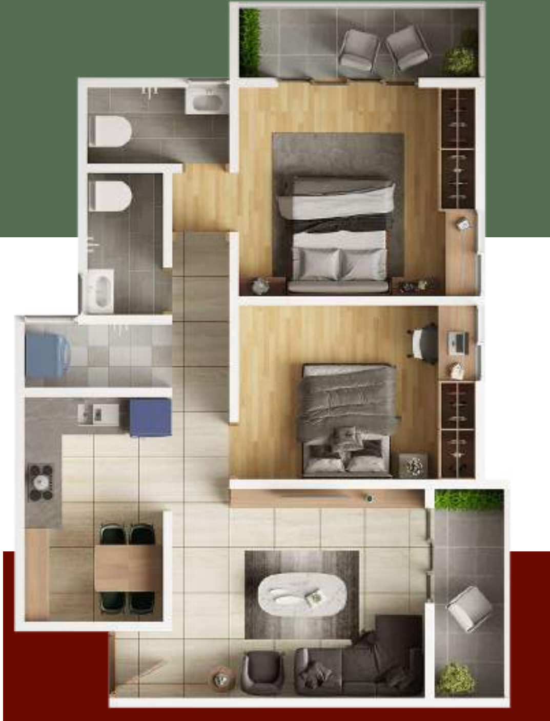
*Representational Image Shown displays Type D Floor Plan