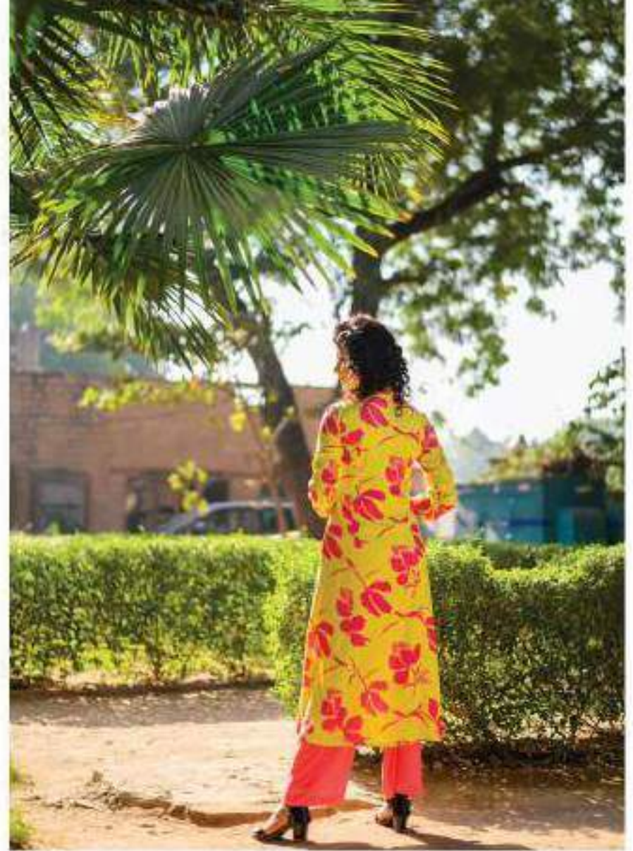
This flamboyant lime kurta with floral print pink colour in it could be your timeless