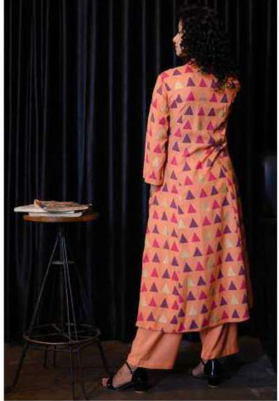
Infuse contemporary charm into your ethnic assortment with your Coral kurta f