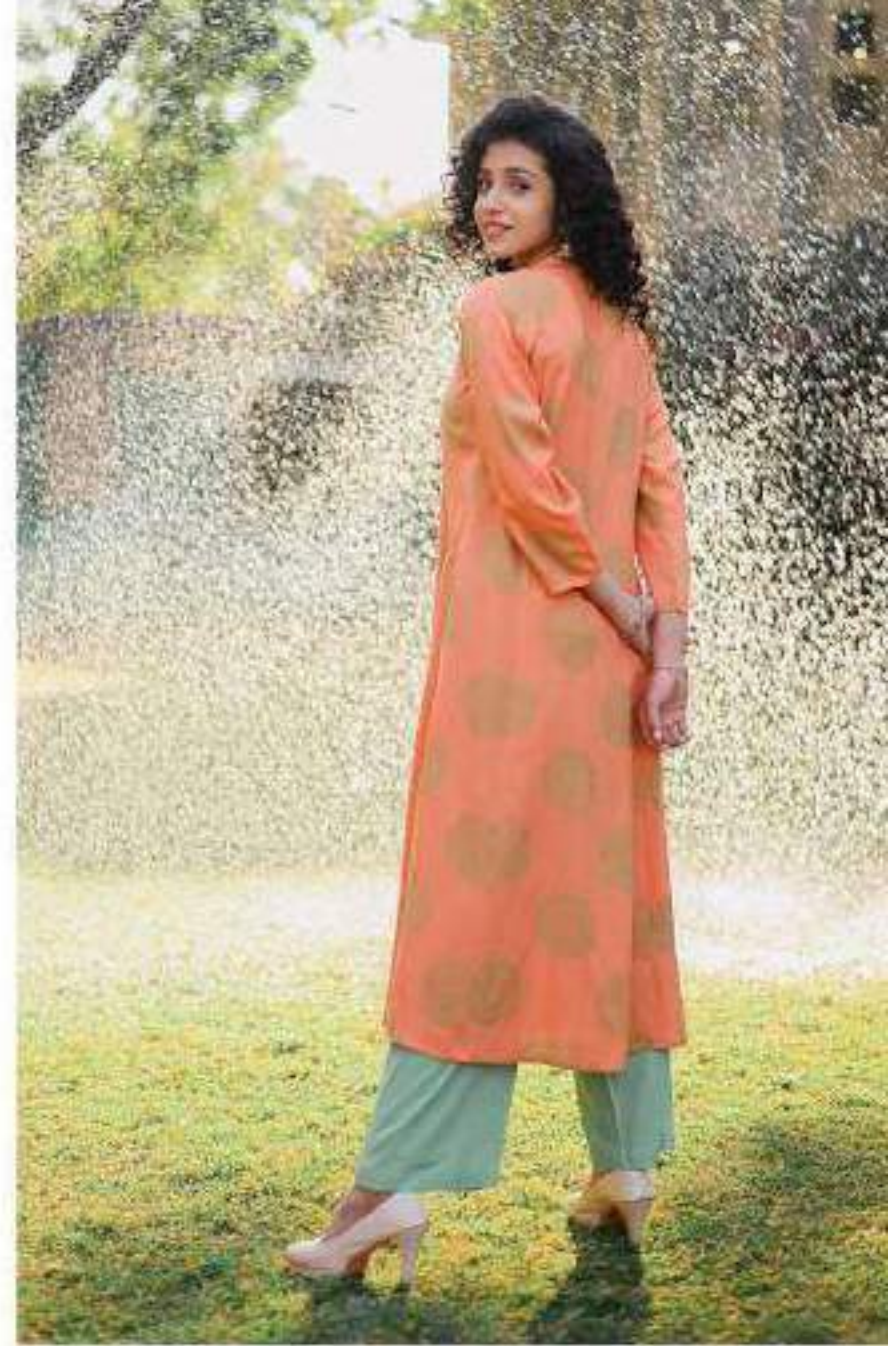
Exuding mix throughout charm this Coral kurta from dehmi will revive your ethn