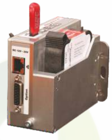
USB stick data transfer Dynamicaly transfers Data created with a PC to the printer