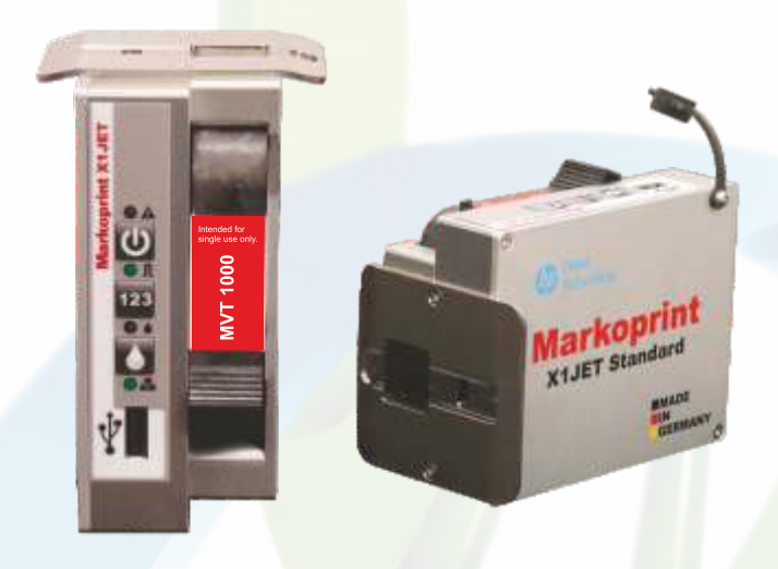
Markoprint X1 JET HP Standard