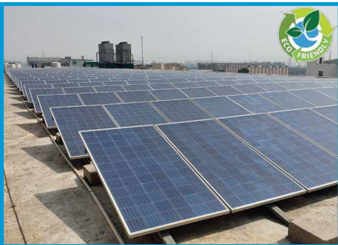
SOLAR PANELS INSTALLED ON OUR ROOF TOP

We also ensure that all your E Way bills & printing related concerns are facilitated at our premise for no hassles during transit.