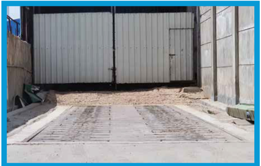
VWSF - VEHICLE WEIGHING SCALE FACILITY (Calibration Certificate & Govt. Approved)