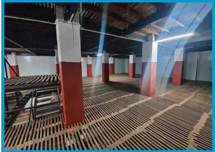
CHAMBER STORAGE SPACE

WE ARE MORE THAN HAPPY TO EXTEND THIS SERVICE WHENEVER THE NEED ARISE FOR YOU TO STORE THE GOODS.