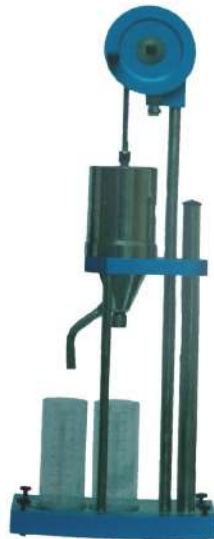
Model No. PET 903 Beating & Freeness Tester (°SR)