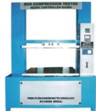
Model No. PET 941