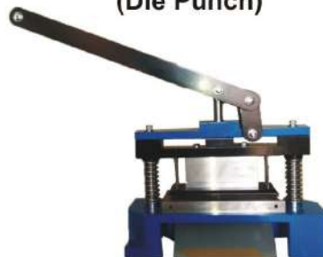
Model No. PET 968 Ply-bond Strip Cutter (Die Punch)