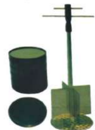
Hand Sheet Former Spare