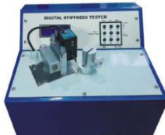
Model No. PET 918 Digital Bending Stiffness Tester