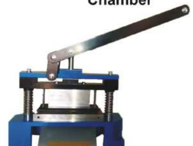
Model No. PET 966 Tensile Strip Cutter (Die Punch)