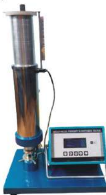
Model No. PET 936

Smoothness, Porosity and Softness Tester (Gurley Type, Automatic)