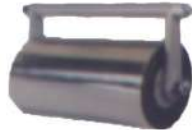
Model No. PET 931