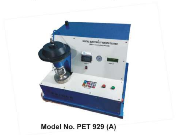
Model No. PET 929 (A)

Digital Bursting Strength Tester (With Printer)