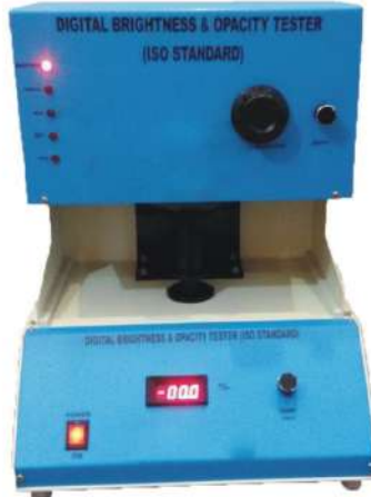
Model No. PET 907 (B)

Digital Brightness & Opacity Tester (ISO Standard)