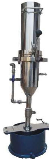
Model No. PET 915 Former