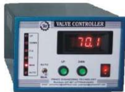
Model No. PET 902 Valve Controller