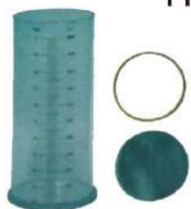
°SR Tester Spare