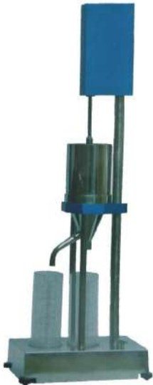
Model No. PET 927 Pneumatic Beating & Freeness Tester (°SR)