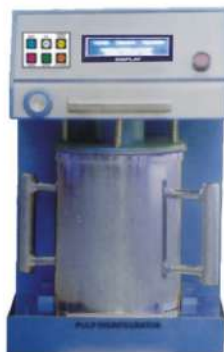
Model No. PET 916