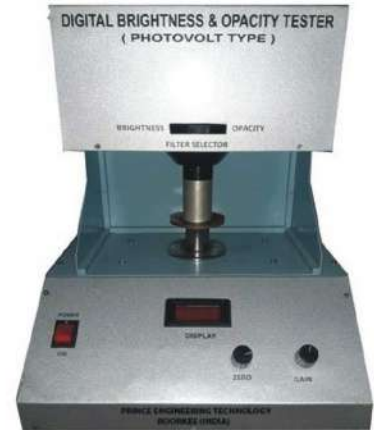
Model No. PET 933

Digital Brightness & Opacity Tester (ISO Standard)