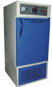
Model No. PET 965 Humidity & Conditioning Chamber