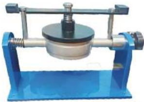
Model No. PET 906