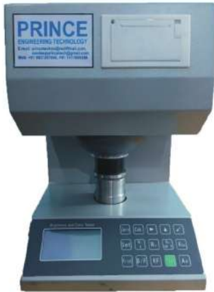
Model No. PET 907 (A)