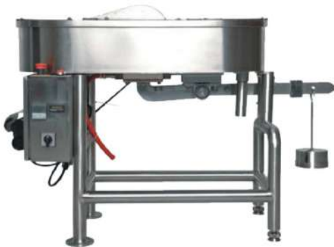
Model No. PET 925

Digital Brightness & Opacity Tester (Photovolt Type)