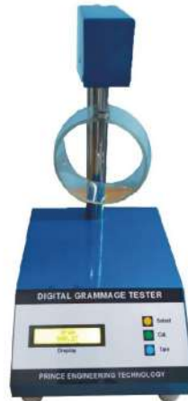
Model No. PET 904 (A)