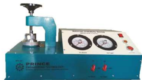
Model No. PET 929 (C)

Manual Bursting Strength Tester (For Paper)