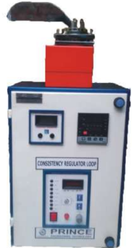
Model No. PET 917