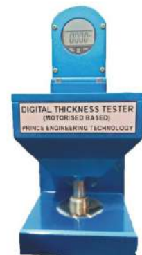
Model No. PET 962