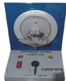
Model No. PET 963 Manual Bending Stiffness Tester