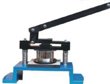
Model No. PET 928 Circular Cutter (Die Punch)