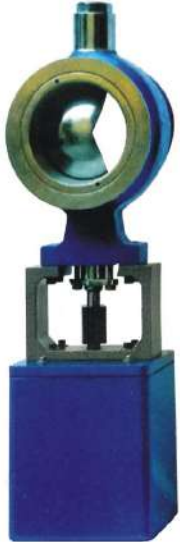
Model No. PET 901