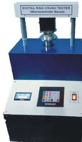
Model No. PET 906

Tensile Strength Tester (Microprocessor Based)