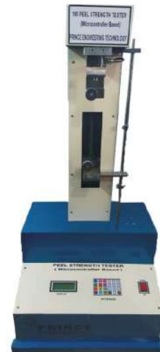
Model No. PET 961