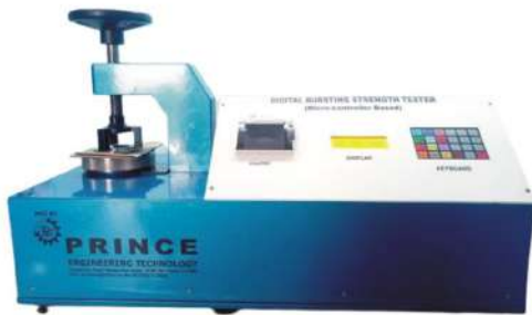
Model No. PET 905 (C)

Digital Bursting Strength Tester (With Printer)