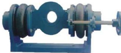
Model No. PET 924 (A)