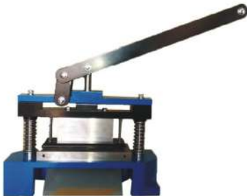
Model No. PET 920 RCT Strip Cutter (Die Punch)