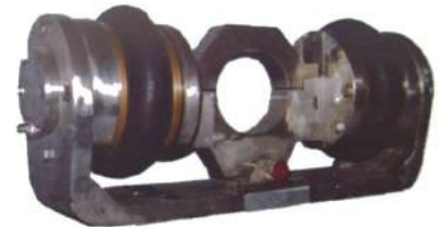
Model No. PET 924 (C) Auto Guide