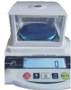
Model No. PET 904 (B)