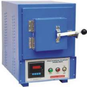
Model No. PET 950 Digital Muffle Furnace