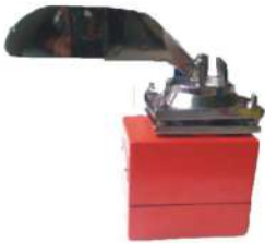
Consistency Transmitter Blade