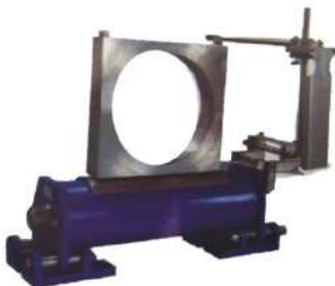
Model No. PET 924 (B) Auto Guide