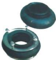
Auto Guide Bellow