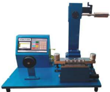
Model No. PET 940