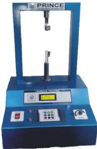
Model No. PET 908

Tensile Strength Tester (Microprocessor Based)