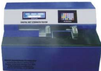
Model No. PET 924 Digital Wet Strength Tester