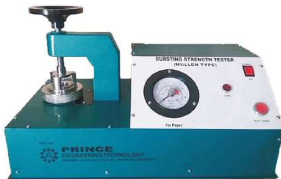
Model No. PET 929 (B)

Pneumatic Bursting Strength Tester (With Printer)