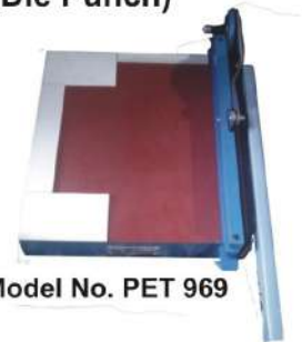
Model No. PET 969