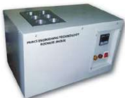
Model No. PET 967 COD Digestor