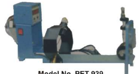
Model No. PET 939

Paper Surface Oil Absorbency Tester (SOAT)