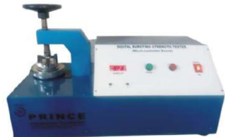
Model No. PET 905 (B)