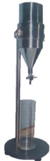
Model No. PET 926 Consistency Determination Apparatus