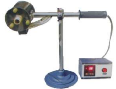
Model No. PET 932 Ash Incinerator