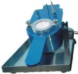
Model No. PET 937 Digital COP Tester