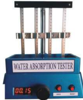
Model No. PET 938 Water Absorption Tester