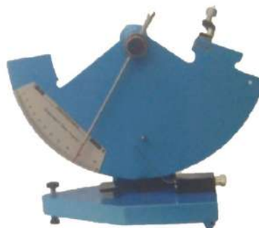
Model No. PET 910

Smoothness, Porosity and Softness Tester (Gurley Type, Automatic)