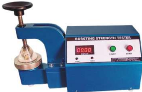
Model No. PET 905 (A)