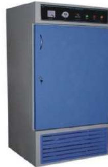
Model No. PET 964 BOD Incubator