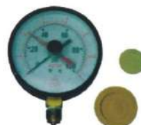
Bursting Strength Tester Spare