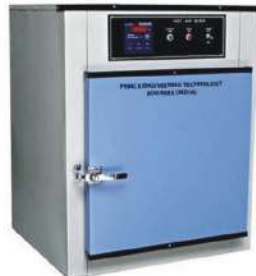
Model No. PET 913 Digital Oven