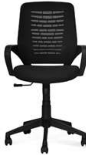
Mid Back Chair

Mesh back chair with fabric upholstered seat (foam base) PP fixed arms Centre Tilt (butterfly) Mechanism 100mm class 4 glass lift (BIFMA standard) Nylon star base & twin wheel Castors color- balck