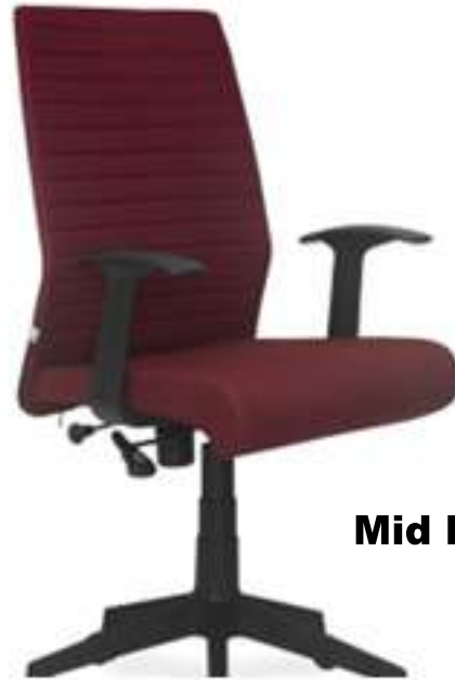
Mid back chair