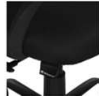
Mid Back Chair