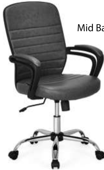
Mid Back Chair