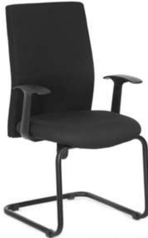
Mid Back Chair