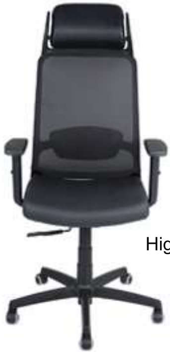
High back chair