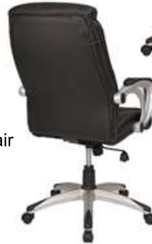
High Back Chair