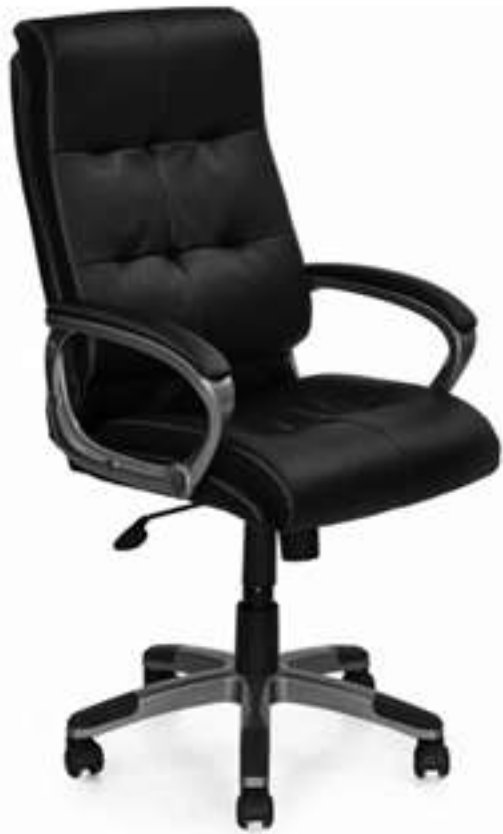
High Back Chair