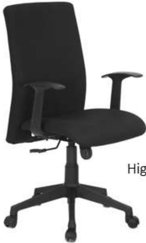
High Back Chair