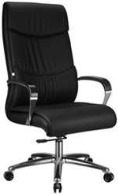
High Back Chair