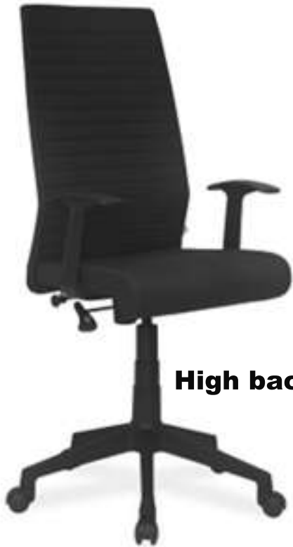
High back chair