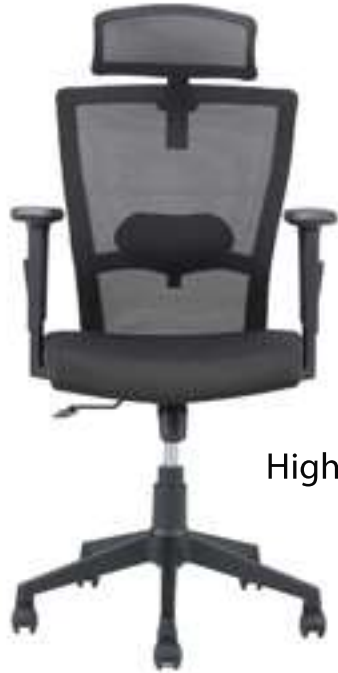
High Back Chair