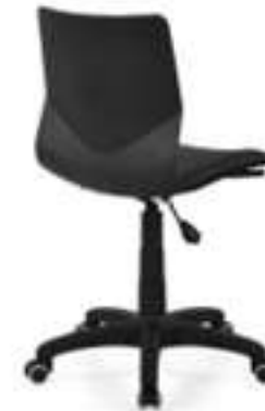
High Back Chair