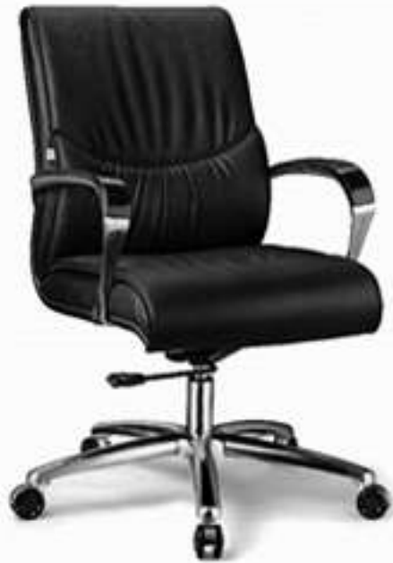
Mid Back Chair