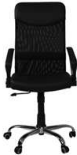
High Back Chair