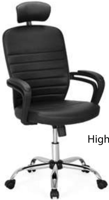
High Back Chair