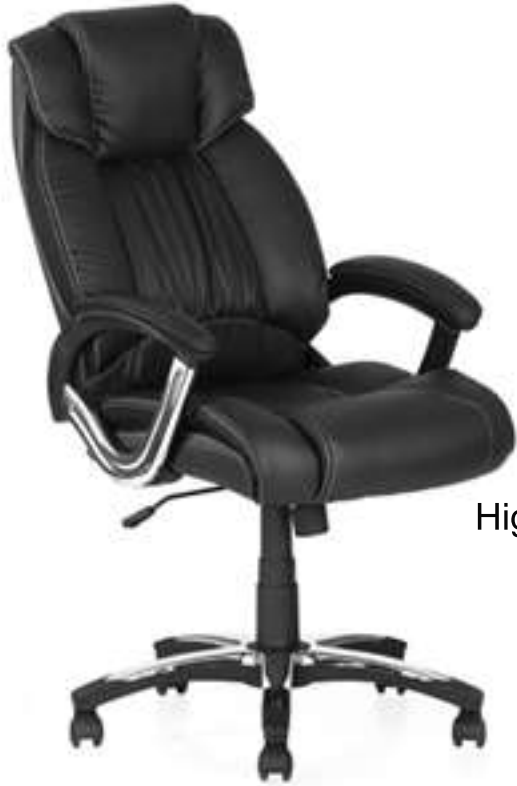
High Back Chair