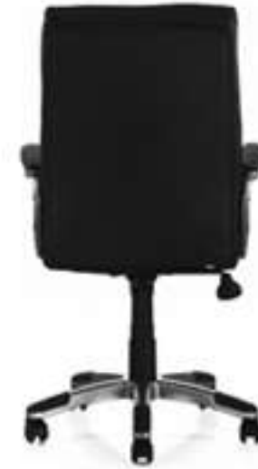
High Back Chair