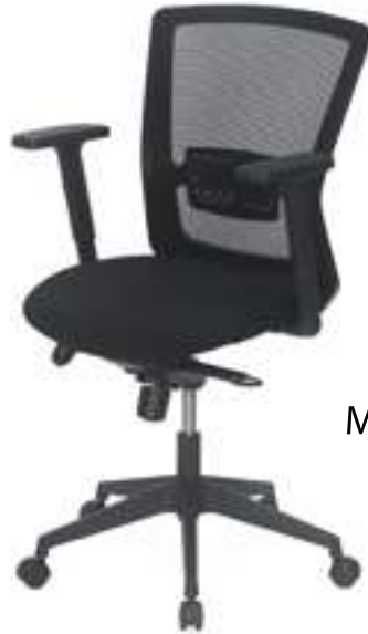
Mid Back Chair