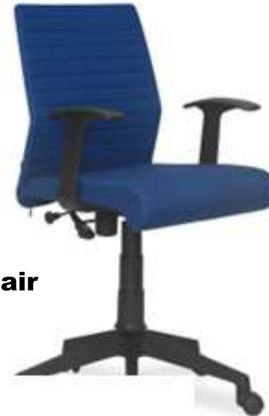
Low back chair