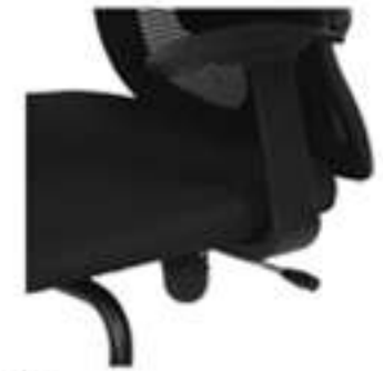
Mid Back Vistor Chair