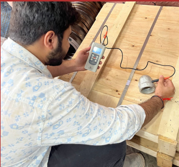
HDG MICRON COAT TEST