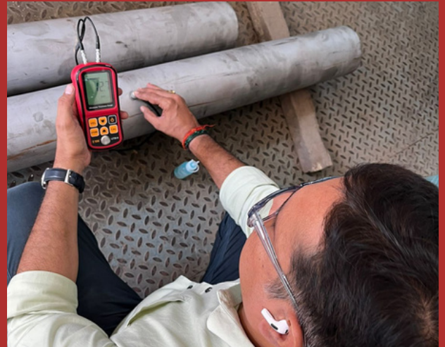
D - METER THK TEST