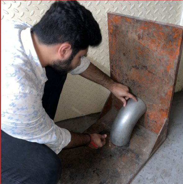
90 deg Angle Check