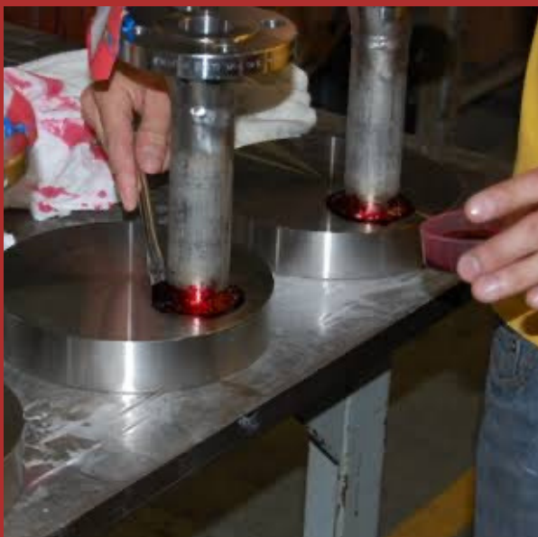
Dye Penetration Test