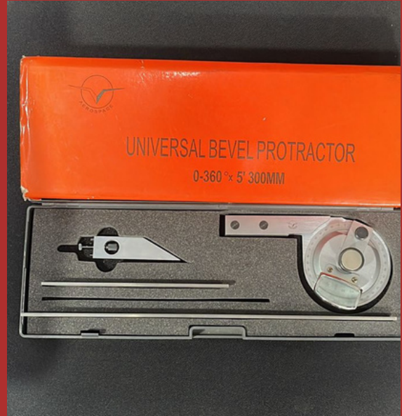
Universal Bevel Protractor