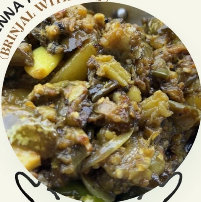
BEGENNA PETU BHAJI - ₹150 (BRINJAL WITH FISH)