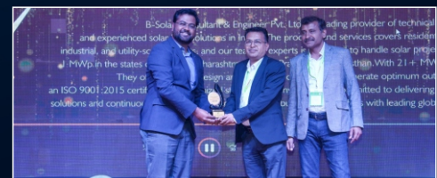
Award from IE-RBM