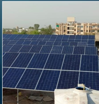
50KW Viramgam Motabhai Electronics