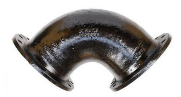
DOUBLE FLANGED BEND