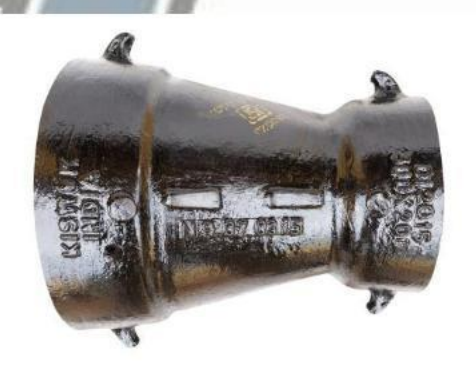
DOUBLE SOCKET TAPER