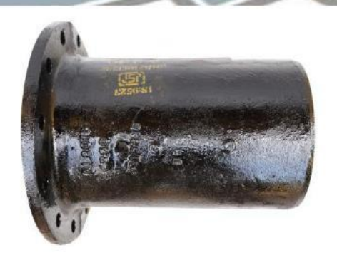
FLANGED SPIGOT TAIL PIECE