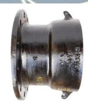
FLANGED SOCKET TAIL PIECE