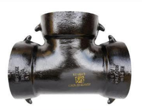
ALL SOCKET TEE