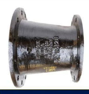
DOUBLE FLANGED TAPER