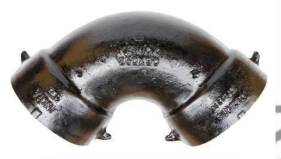
DOUBLE SOCKET BEND