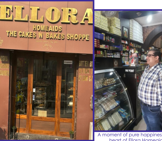
Front Elevation of our newly renovated showroom Ellora Homeaids

A moment of pure happiness in the heart of Ellora Homeaids' transformation