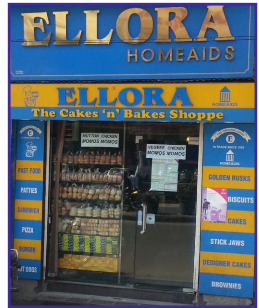
A Picture from the season of 2013

taking online classes from their respective colleges situated in different cities. Now that I have committed myself to bring the publication to its destination.