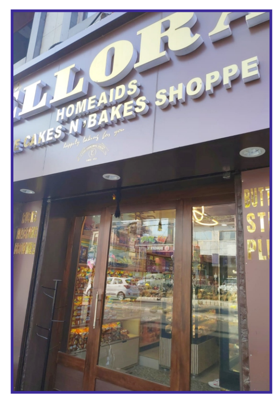
A picture from the season of 2024, newly renovated store of Ellora Homeaids