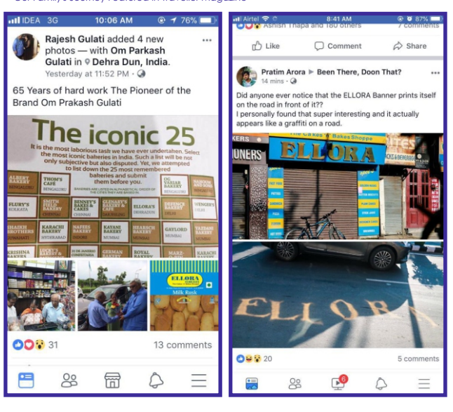
Icing perfection at Ellora Homeaids