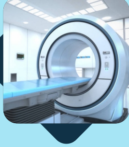
SHASHWAT DIAGNOSIS (MRI, CT SCAN, DOPPLER, MEMOGRAPHY, USG, X-RAY) [KOTHIYA HOSPITAL CAMPUS, NIKOL]