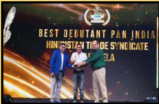
Century Udaan Club at Bali, Indonesia