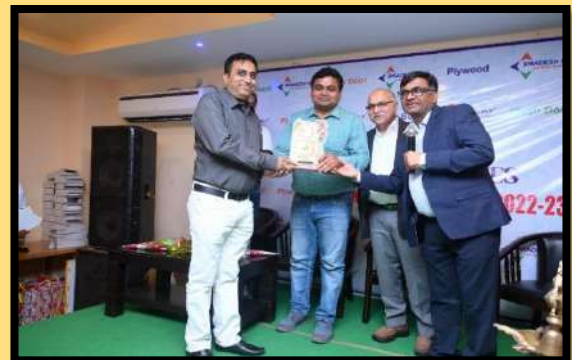
Swadesh's 1 st Dealer in Odisha