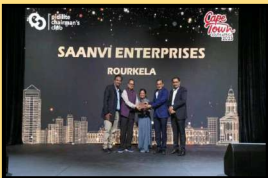
Pidilite Chairman's Club at South Africa