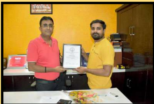
IIA Odisha Chapter Felicitation