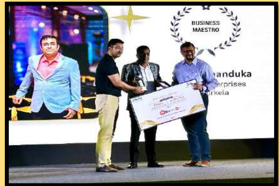
Business Maestro Award at Tally MSME Awards 2024