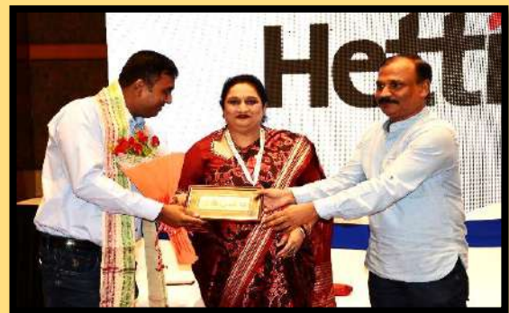
IIA Odisha - Rourkela Centre Appreciation