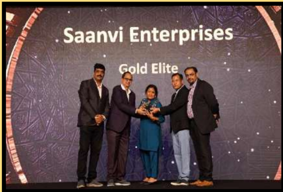
Pidilite Gold Elite Chairman Club at Abu Dhabi, UAE