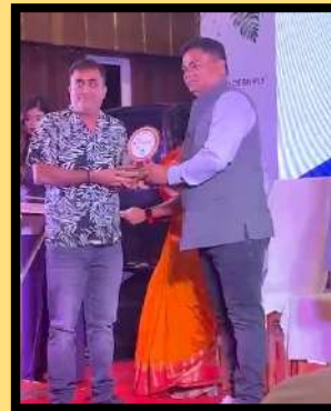
Swadesh Award for 3 rd Highest Sale in Odisha, 2023-24