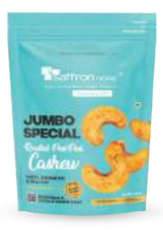
Roasted Peri Peri Cashew (250gm)