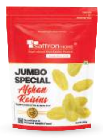
Afghan Raisins (250gm)