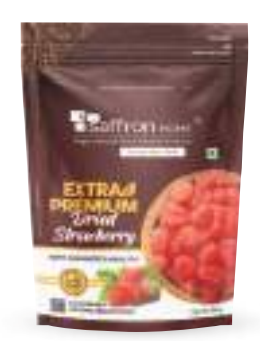
Dried Strawberry (200g)