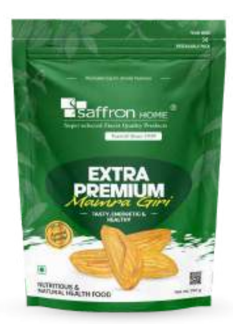
Mamra Giri (250gm)