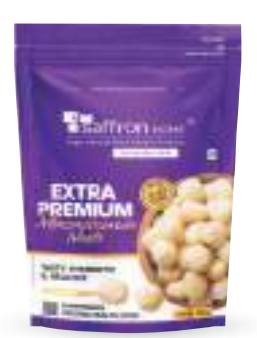
Macadamia Nuts (200g)