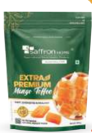
Mango Toffee (200g)