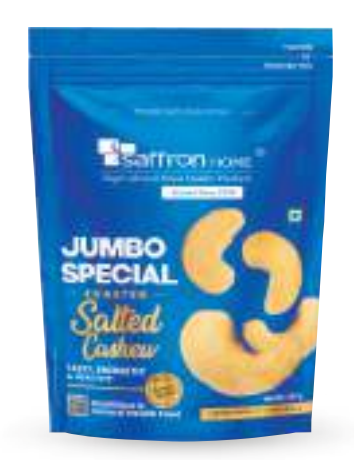
Salted Cashew (250gm)