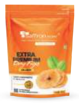
Dry Fig (200g)