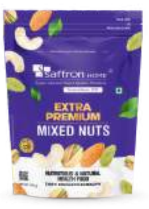
Mixed Nuts (200g)