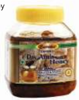
Dry Amla with Honey