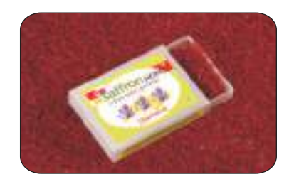
Diamond Brand Saffron