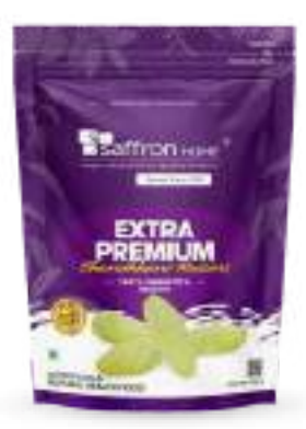
Shondkhani Raisins (250gm)