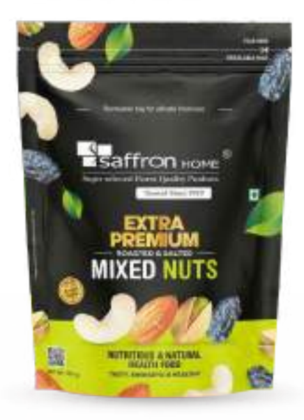
Roasted & Salted Mixed Nuts (100gm)