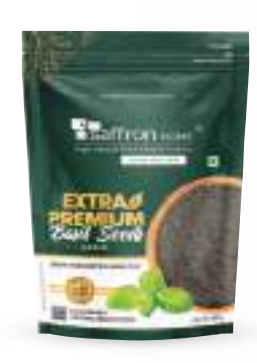
Basil Seeds (200g)