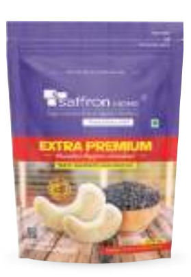
Roasted Pepper Cashew (200g)