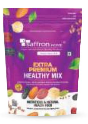
Healthy Mix (200g)