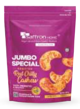
Roasted Red Chilly Cashew (250gm)