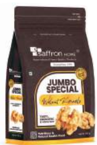
Walnut Kernels (250gm)