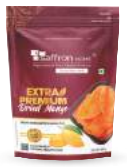
Dried Mango (200g)