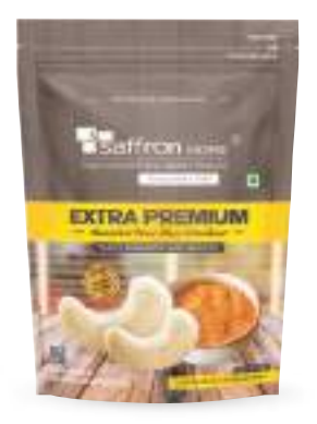
Roasted Peri Peri Cashew (200g)