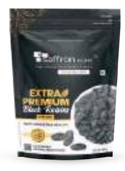
Black Raisins with Seed (200g)