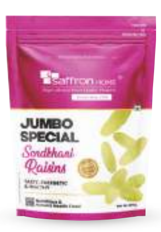
Sondkhani Raisins (250gm)