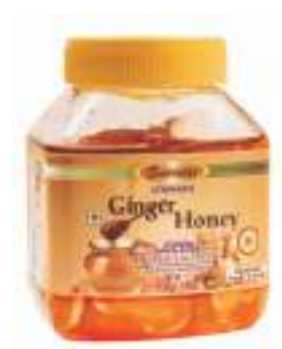
Gingerchips with Honey