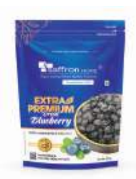
Dried Blueberry (200g)