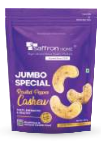
Roasted Pepper Cashew (250gm)