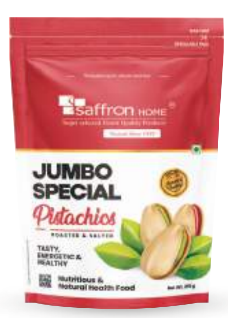
Roasted & Salted Pistachios (250gm)