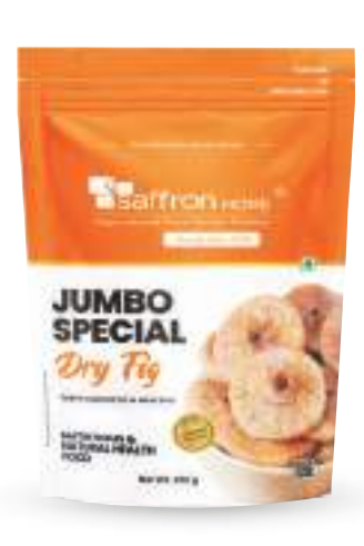
Dry Fig (250gm)