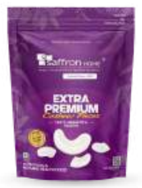
Cashew Pieces (250gm)