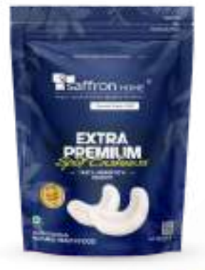
Split Cashews (250gm)