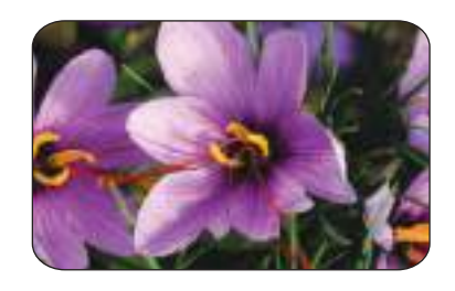
Irani Saffron Flower