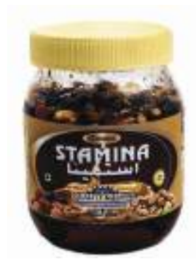
Dry Fruit with Honey