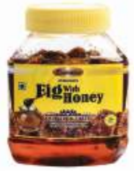
Fig with Honey