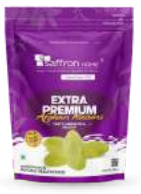
Afghan Raisins (250gm)