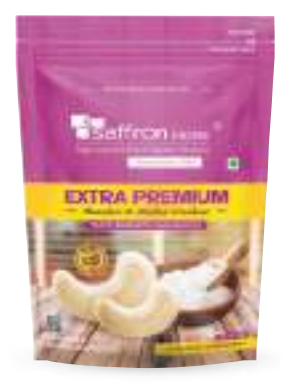
Roasted & Salted Cashew (200g)