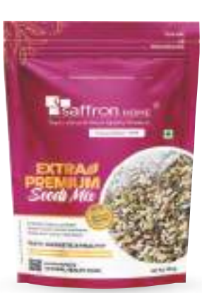
Seeds Mix (200g)