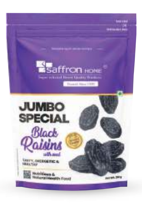
Black Raisins with Seed (250gm)