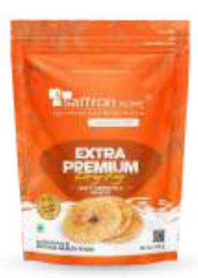
Dry Fig (250gm)