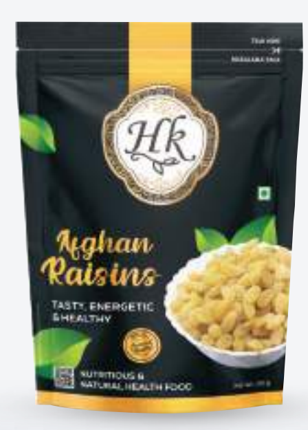
Afghan Raisins (200gm)