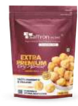
Dry Apricot (200g)