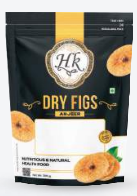
Dry Fig - Anjeer (200gm)