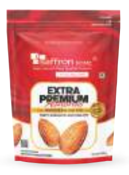
Roasted & Salted Almonds (200g)