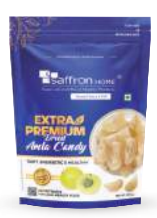
Dried Amla Candy (200g)