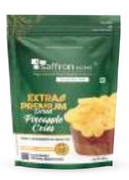
Dried Pineapple Coins (200g)