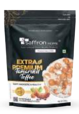
Tamarind Toffee (200g)