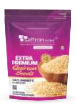
Quinoa Seeds (200g)