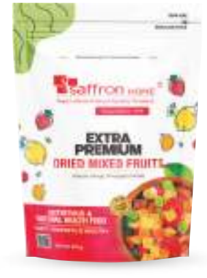
Dried Mixed Fruits (200g)