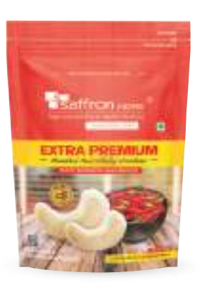
Roasted Red Chilly Cashew (200g)