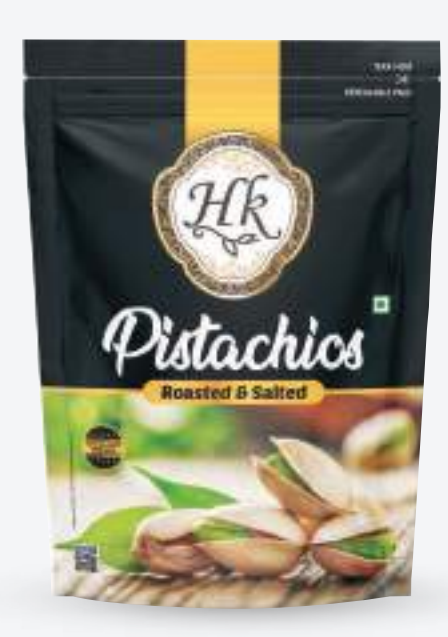
Roasted & Salted Pistachios (250gm)