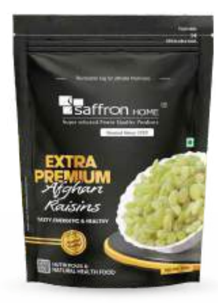
Afghan Raisins (100gm)