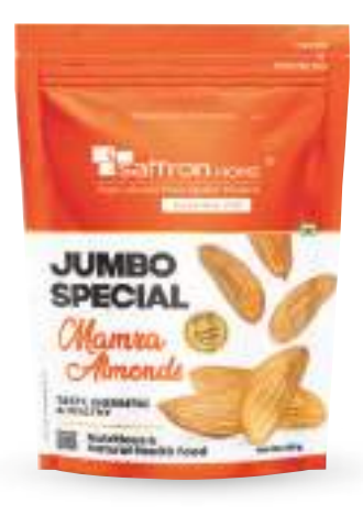
Mamra Almonds (250gm)