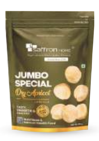
Dry Apricot (250gm)