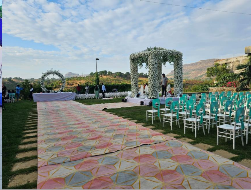
VARMALA STAGE & VIDHI MANDAP