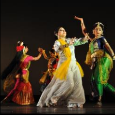
SANGEET/ RECEPTION CEREMONY