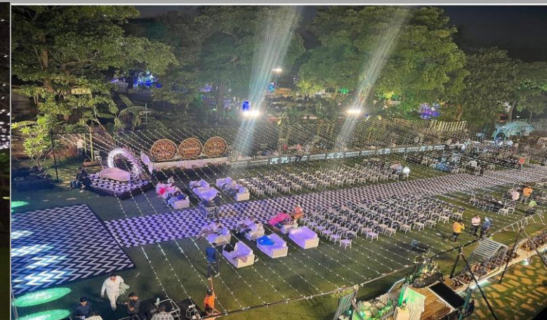
LAWN 1 SEATING AREA