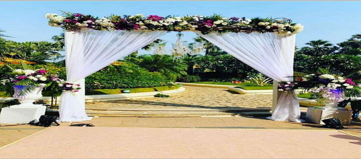
FLAT FLORAL GATE