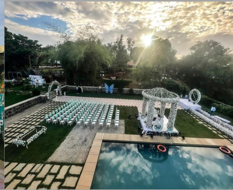
HILL VIEW LAWN SETUP