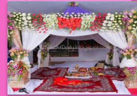
VARMALA & SHADI CEREMONY