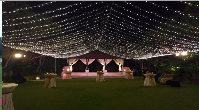
CHERRY LIGHTS CEILING