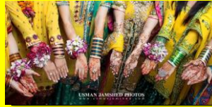
HALDI / MEHNDI CEREMONY