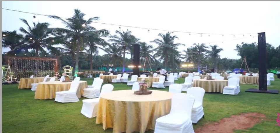
ROUND TABLE SEATING