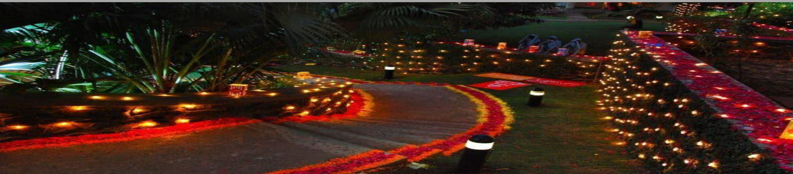
STAIRCASE WALKWAY WITH CHERRY LIGHTS AND FLORAL PETAL THEME