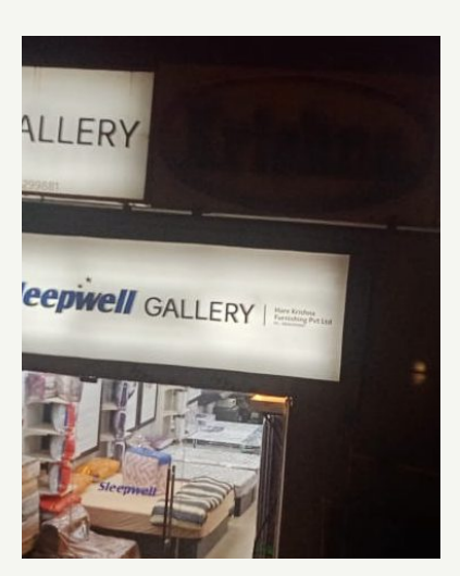
DT City Center