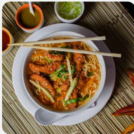
Thukpa Soup Noodle