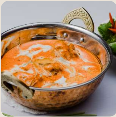
Chicken Butter Masala