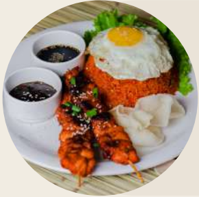
NASI GORENG RICE WITH CHICKEN / PORK SATAY