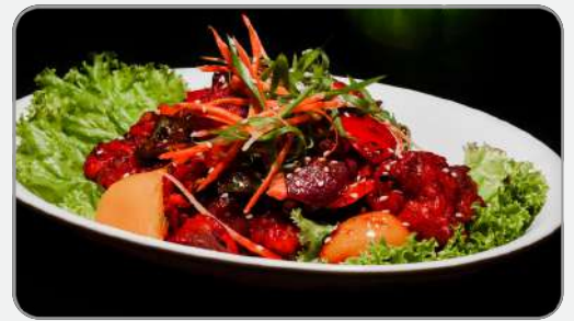
Crispy Chili Chicken