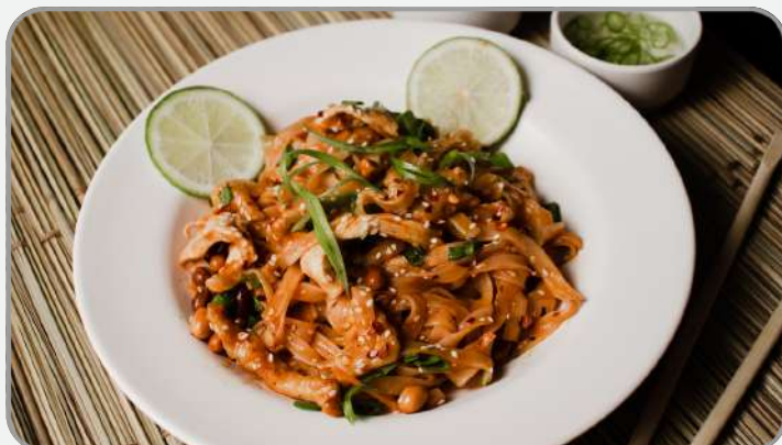
Pad Thai Noodle