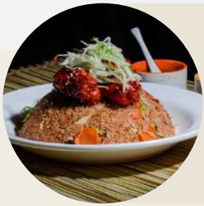
BBQ RICE WITH CHICKEN / PORK