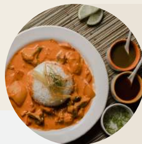
THAI RED CURRY WITH PLAIN RICE