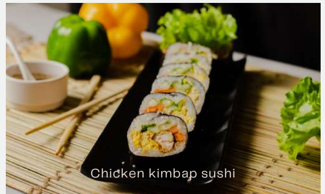
Chicken kimbap sushi