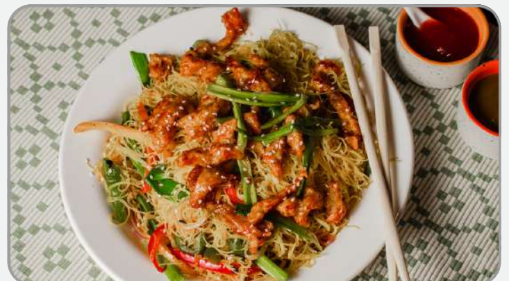
Singapore Rice Noodle