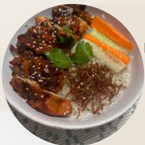
LEMONGRASS GRILLED CHICKEN WITH RICE BOWL