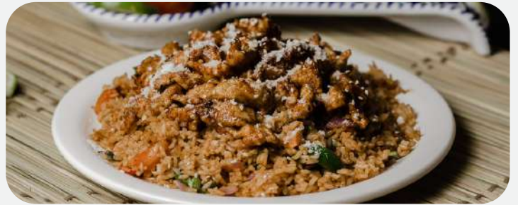
Thai Fried Rice