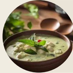
THAI GREEN CURRY WITH PLAIN RICE