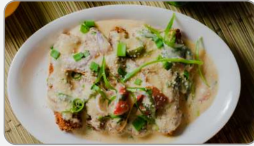
General TSO Chicken