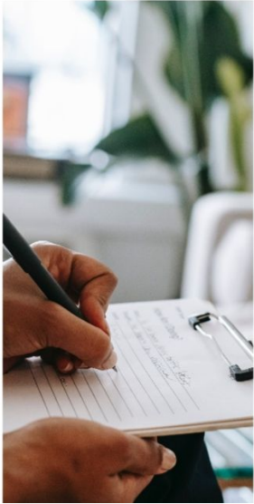
Understanding Clients requirements