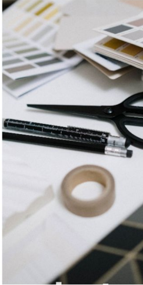
Design & Selection