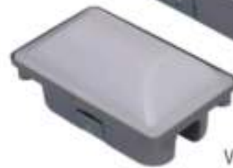
V - 223