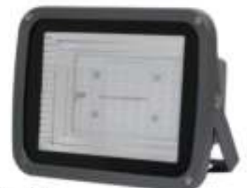
V - 191