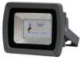
V - 188

Aluminium casting with water proof (Heavy Duty) IP - 65