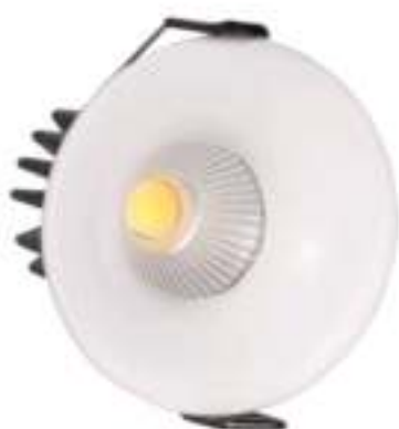
V - 134