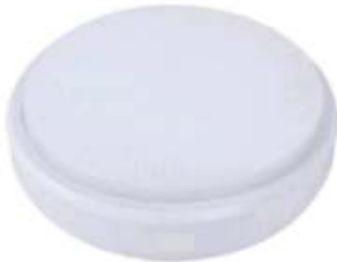
V - 219