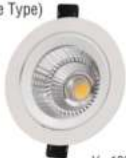
V - 126