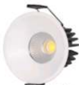
V - 132