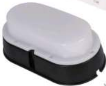
V - 222