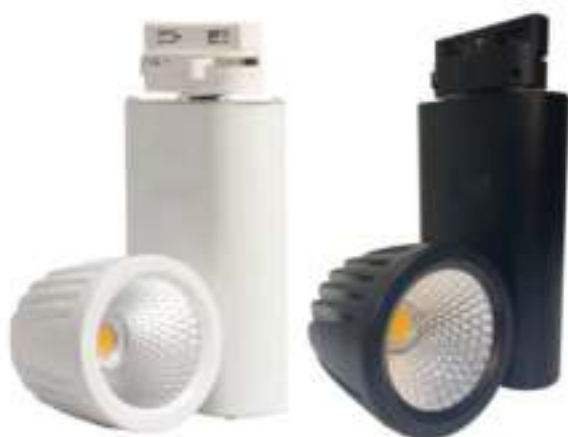
V - 213

Led Make : Cree / Bridgelux Driver : Philips / Fulham Colour Temp : 3000 / 4000 / 6500 K Lumens Efficiency : 130 Lm / W Led Beam Angle : 24° / 36° / 60° Body Colour : White / Black Material : Aluminum Die Casting Reflector : Shintand / Darkoo