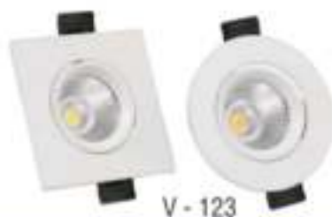
V - 123