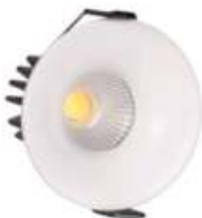
V - 133