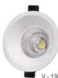
V - 130