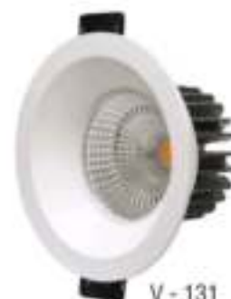
V - 131