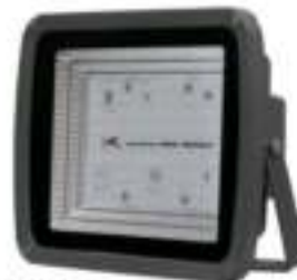
V - 190