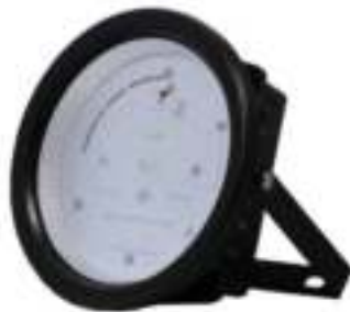
V - 204