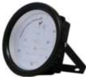
V - 203