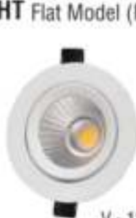
V - 125