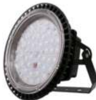
V - 205