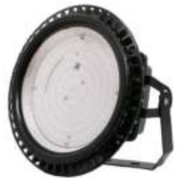
V - 206