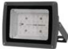
V - 189