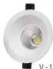
V - 128

Led Make : Cree / Bridgelux Driver : Philips / Folkam Colour Temp : 3000 / 4000 / 6500 K Lumens Efficiency : 130 Lm / W Led Beam Angle : 24° / 36° / 60° Body Colour : White / Black HeatSink Colour : Grey / Black Material : Aluminum Die Casting Reflector : Shintand / Darkoo