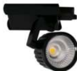
V - 215