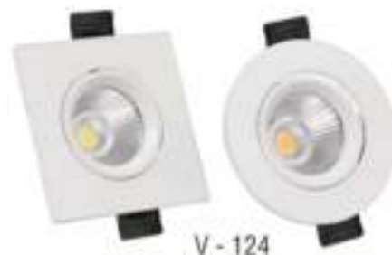
V - 124