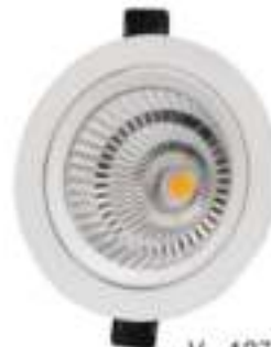
V - 127