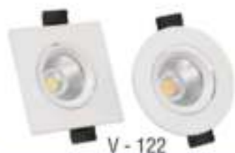
V - 122