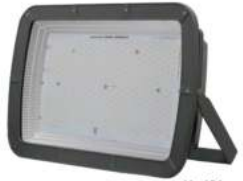
V - 194