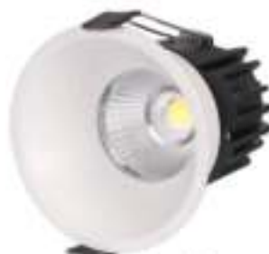
V - 133