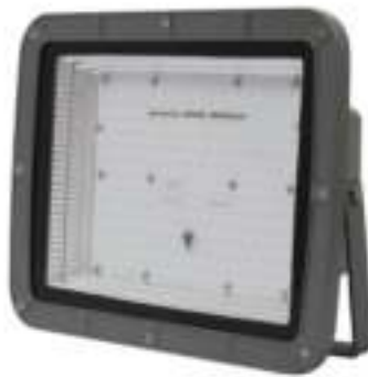
V - 193