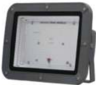
V - 192