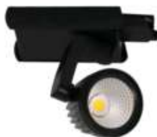
V - 214

Led Make : Cree / Bridgelux Driver : Philips / Fulham Colour Temp : 3000 / 4000 / 6500 K Lumens Efficiency : 130 Lm / W Led Beam Angle : 24° / 36° / 60° Body Colour : White / Black Material : Aluminum Die Casting Reflector : Shintand / Darkoo