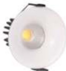
V - 132