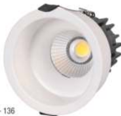
V - 136