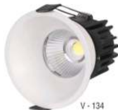
V - 134