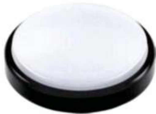
V - 220