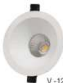
V - 129