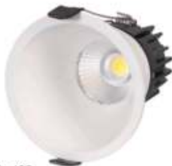
V - 135