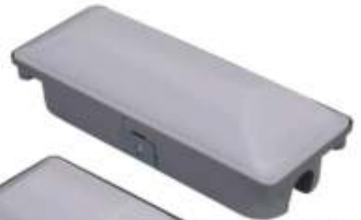
V - 224