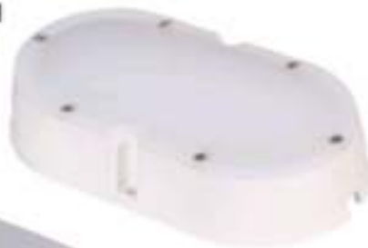
V - 221