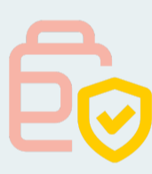
US FDA 510(k)