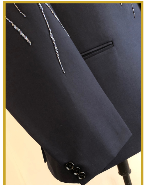
In Frame: Three Piece Suit with Kardhana work and pleated pattern shirt