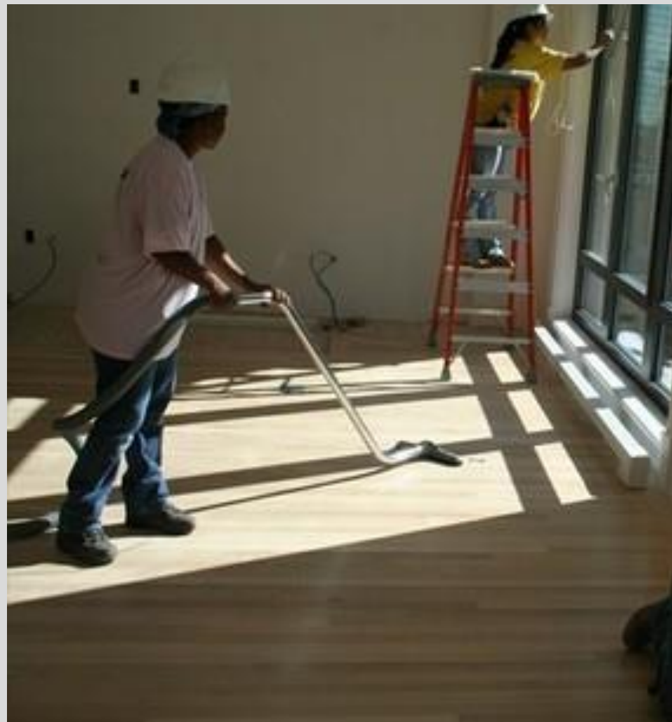
Project Handover Cleaning

We seek to build long-term relationships with our clients.