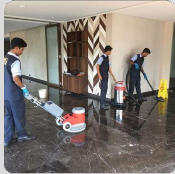
HOUSE KEEPING SERVICES