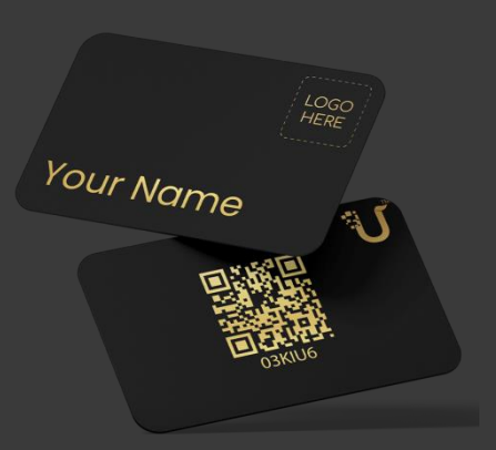
Black & Gold