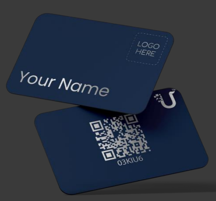
Blue & Silver