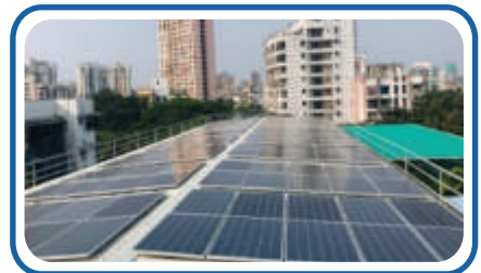
Tin Sheet Installation