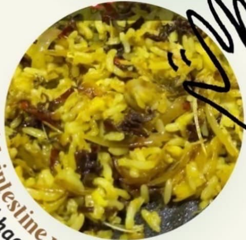
Maasor Petu Bhaat Logot - ₹150 Fish intestine with rice