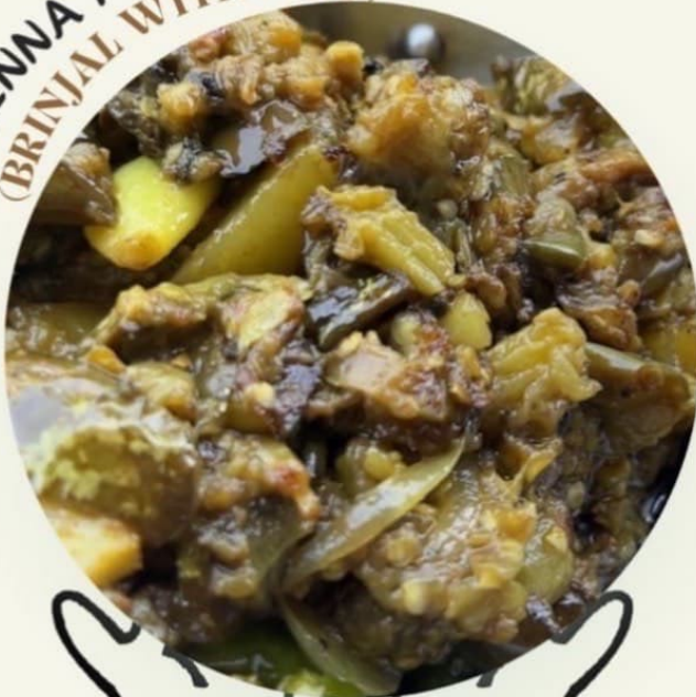
BEGENNA PETU BHAJI - ₹150 (BRINJAL WITH FISH)