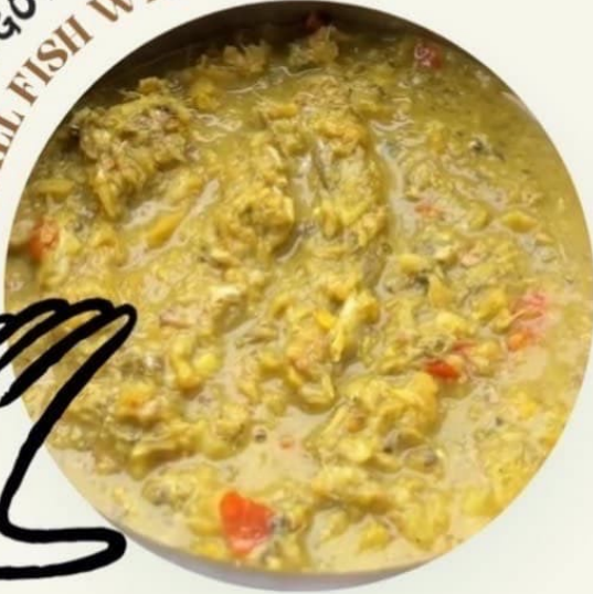
ADAA LOGOT HORU MAAS - ₹200 (SMALL FISH WITH GINGER)