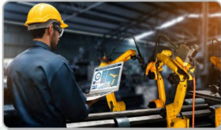
OPERATION & MAINTENANCE