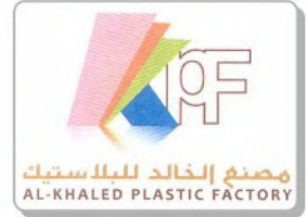
AL-KHALED PLASTIC FACTORY