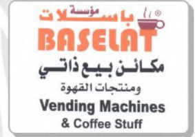
BASELAT VENDING MACHINE & COFFEE STUFF