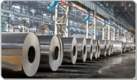
INDUSTRIAL & MANUFACTURING