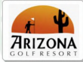
ARIZONA GOLF RESORT