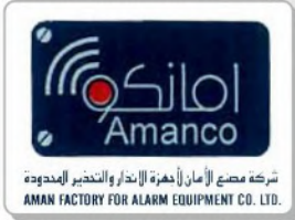
AMAN FACTORY FOR ALARM EQUIPMENT CO. LTD.