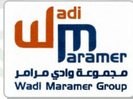
WADI MARAMER GROUP