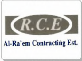
AL-Ra'EM CONTRACTING EST.