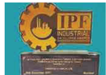
Fastest Growing Chemical Manufacturing Company Award IPF Industrial Excellence

FT FINANCIAL TIMES High - Growth Companies Asia-Pacific