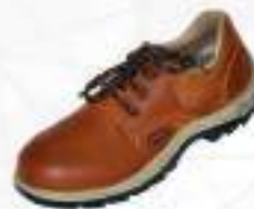
Premium Safety Shoes