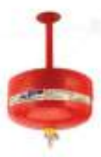
Modular Fire Extinguishers