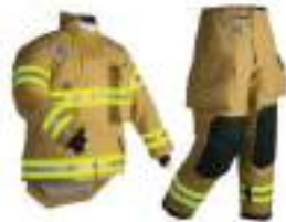
NIOSH Approved Fire Fighting Equipment