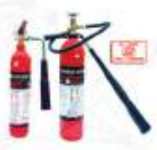
Full Range of Fire Extinguishers