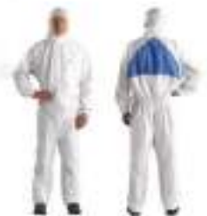
Disposable and Reusable Coveralls