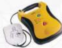
Automated External Defibrillators