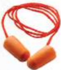
Disposable and Reusable Ear Plugs