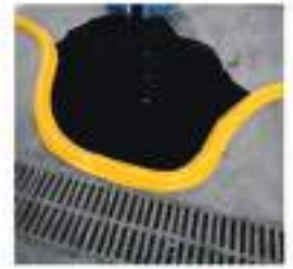
Spill Blocker Dikes