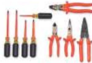
Electrical Insulated Tool Kits