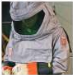
ARC Flash Suits