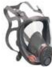
Full Face Reusable Respirators