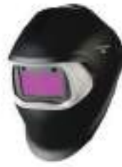
Speed Glass 100v Auto Darkening Helmet