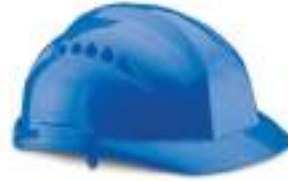
HDPE Safety Helmets