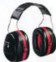
Economy and Premium Ear Muffs