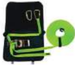
Temporary Lifeline Systems