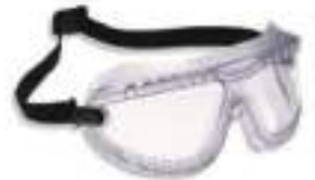
Chemical Proof Splash Goggles