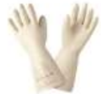
Electrical Hand Gloves