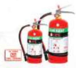
Clean Agent Portable Fire Extinguishers