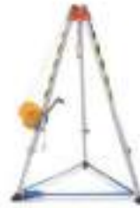
Confined Space Entry Kit