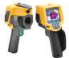
Thermal Imaging Devices