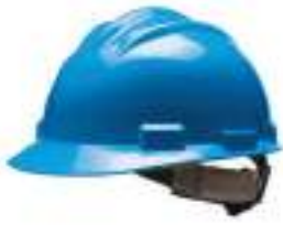
Class E Safety Helmets