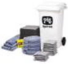
Spill Control Kits