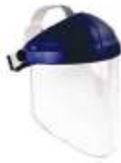
Face Shields for Grinding and Chemical Applications