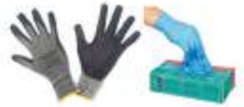
Gloves for all Applications