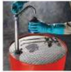
Barrel Top Mats