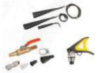
Fire Extinguisher Spares