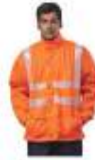
HI- Viz Reflective Jackets