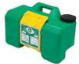
Portable Gravity Operated Eye Wash Stations