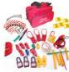
Lockout Tagout Station