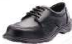
PERNIX SAFETY TOECAP, SAFETY SOLE WITH ANTI-SLIP SAFETY PATTERNS