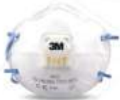
Disposable Respirators for all applications