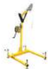
Confined Space Entry