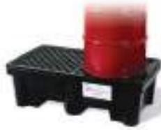
Spill Containment Pallets