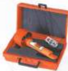
Voltage Detection Equipment