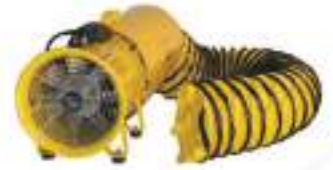
Confined Space Ventilation Systems