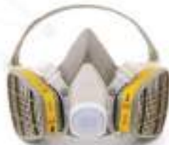
Half Face Respirators