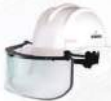
Grinding and Welding ShIELDS