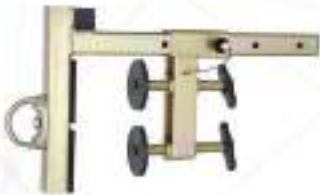
Point and Parapet Anchors