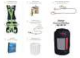
Painting and Rescue Kits