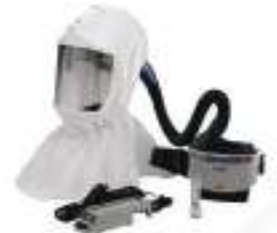
Powered Air Purifying Respirators