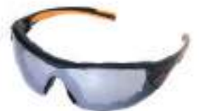
Safety Eye Wear