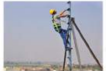
Fixed Line Systems