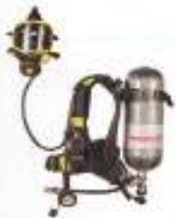
Self Contained Breathing Apparatus