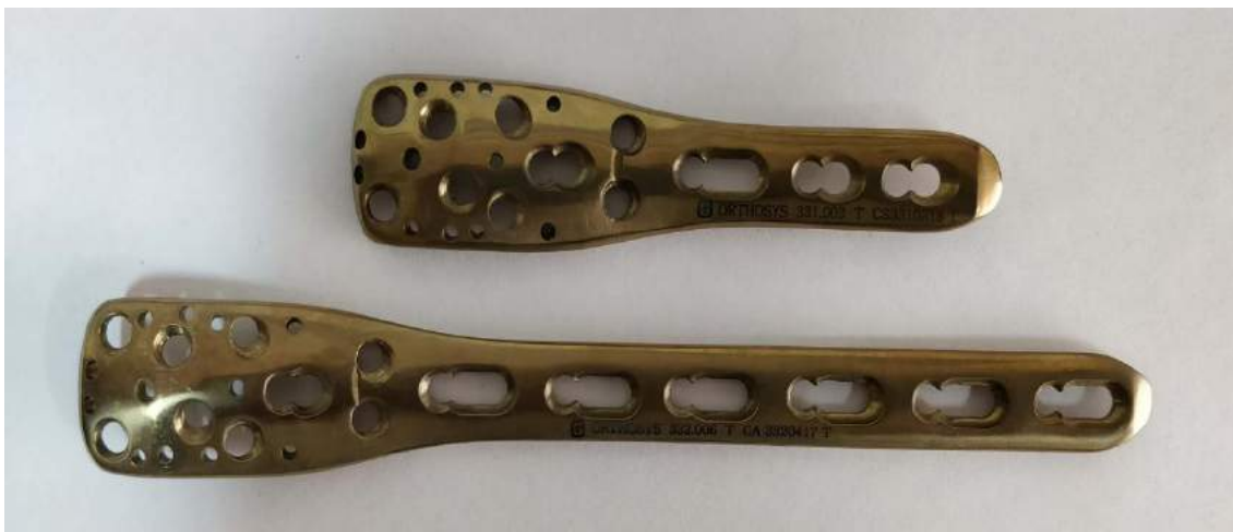
Cat No: 331.003T/331.003- 331.005T/331.005 Philos Plate 3.5 mm LCP Short (TiT/SS)- (3 -5 Holes) Cat No: 332.004T/332.004 - 332.012T/332.012 Philos Plate 3.5 mm LCP Long (TiT/SS)- (4 -12 Holes)