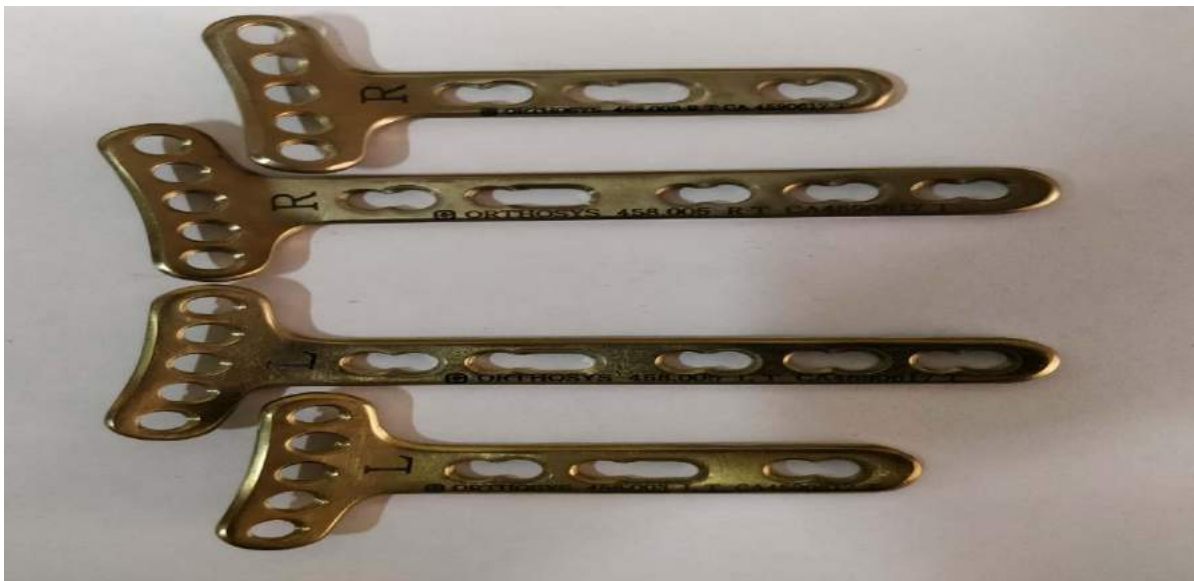
Cat No: 458.003 LT/RT /458.003 L/R - 458.005 LT/RT /458.005 L/R Distal Radius Volar EA 5 H (Left /Right) 2.7 mm LCP (TiT/SS)- (3 -5 Holes)