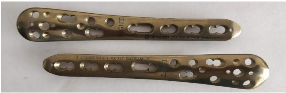
Cat No: 334.004 LT/RT /334.004 L/R - 334.014 LT/RT /334.014 L/R Distal Tibia Medial (Left /Right) LCP (TiT/SS)- (4 -14 Holes)