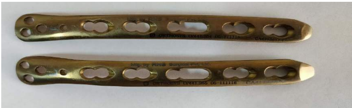
Cat No: 412.003 LT/RT /412.003 L/R - 412.009 LT/RT /412.009 L/R Dorsolateral Plate (Left /Right) 2.7/3.5 mm LCP (TiT/SS)- (3 -9 Holes)