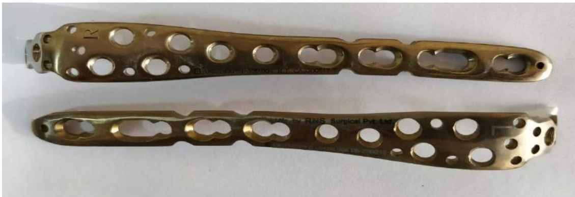
Cat No: 330.002 LT/RT /330.002 L/R - 330.008 LT/RT /330.008 L/R Olecranon Plate (Left /Right) 3.5 mm LCP (TiT/SS)- (2 -8 Holes)