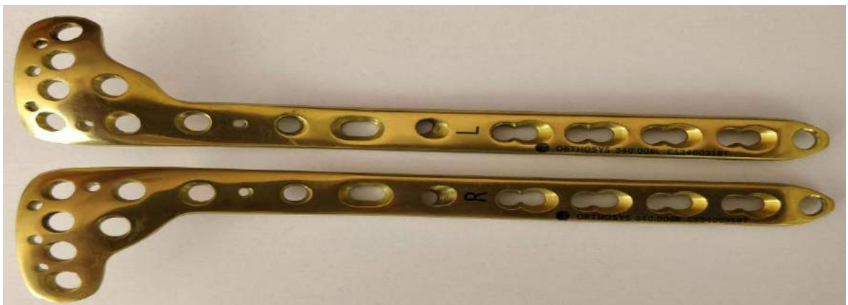
Cat No: 340.004 LT/RT /340.004 L/R - 340.012 LT/RT /340.012 L/R Proximal Lateral Tibia (O) (Left /Right) 3.5 mm LCP (TiT/SS)- (4 -12 Holes)