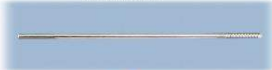
Schanz Screw Cat No. 94.025 Sizes : Dia 2.5mm