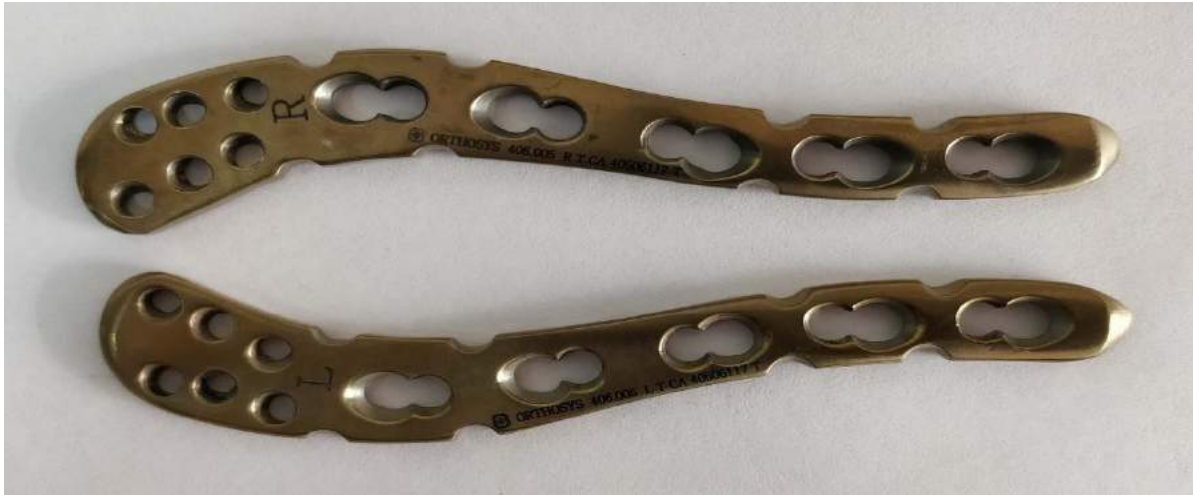
Cat No: 406.004 LT/RT /406.004 L/R - 406.006 LT/RT /406.006 L/R Clavicle Plate with Lateral Extension (Left /Right) 3.5 mm LCP (TiT/SS)- (4 -6 Holes