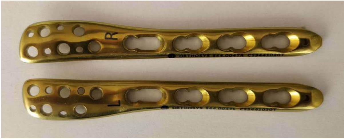
Cat No: 344.004 LT/RT /344.004 L/R - 344.010 LT/RT /344.010 L/R Lateral Distal Fibula (Left /Right) LCP (TiT/SS)- (4 -10 Holes)