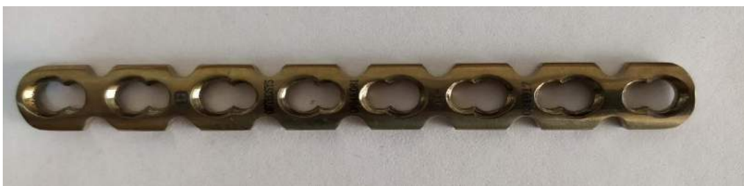
Cat No: 320.005T/320.005 - 320.012T/320.012 Lock-in Recon Combi Hole Plate 3.5 mm (TiT/SS)- (5 -12 Holes)