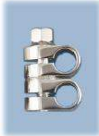
Tube To Tube Clamp Cat No. 88.010