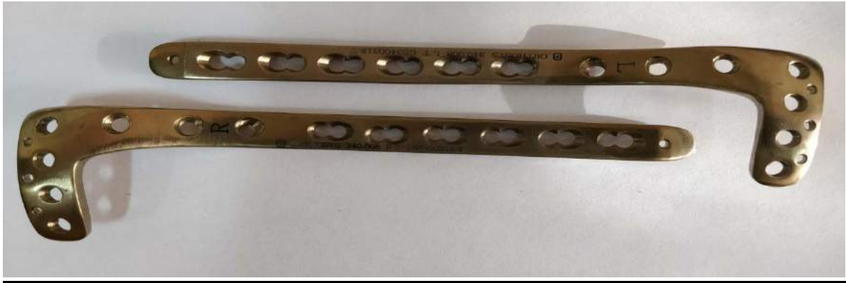
Cat No: 340.004 LT/RT /340.004 L/R - 340.012 LT/RT /340.012 L/R Proximal Lateral Tibia (Left /Right) 3.5 mm LCP (TiT/SS)- (4 -12 Holes)