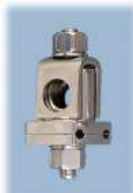
Double Pin Clamp Cat No. 88.006