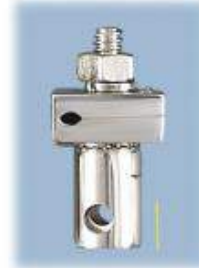
Mini Single Pin Clamp 4.0x2.5mm Cat No. 88.001