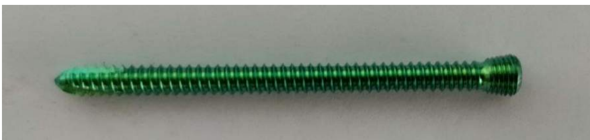
Cat No: 304.012T- 304.012 - 304.085T- 304.085 3.5 mm Locking Head Screw (TiT/SS)- (12 -85 mm)