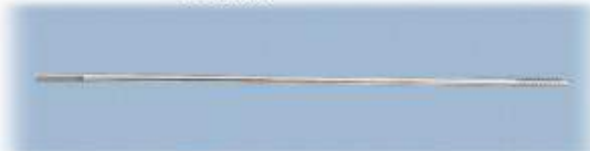
Schanz Screw Cat No. 94.040 to 94.050 Sizes : Dia 4.0, 4.5 & 5.0mm