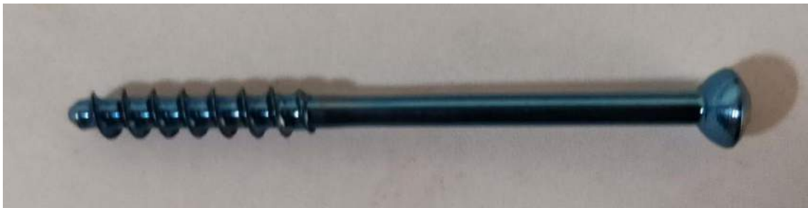
Cat No: 007.020T- 007.020 - 007.060T- 007.060 4.0 mm Cancellous Screw Part Threaded (TiT/SS)- (20 -60 mm)