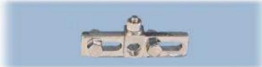
Transverse Clamp Cat No. 88.011