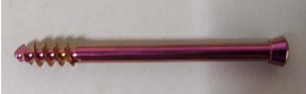
Cat No: 379.040T- 379.040 - 379.090T- 379.090 5.2 mm cancellous screw 16 mm TH (TiT/SS)- (40 -90 mm)