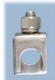
Connecting Clamp Cat No. 88.008