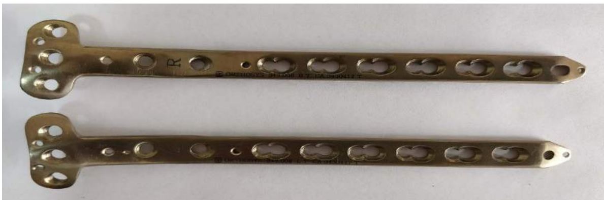
Cat No: 343.004 LT/RT /343.004 L/R - 343.010 LT/RT /343.010 L/R Medial Proximal Tibia (Left /Right) 3.5 mm LCP (TiT/SS)- (4 -10 Holes)