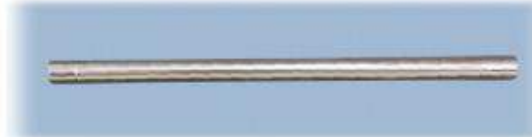
Tubular Rod Rod 11.0mm Cat No. 91.100 to 91.500 Sizes : Length 100 to 500mm (50mm Diff)