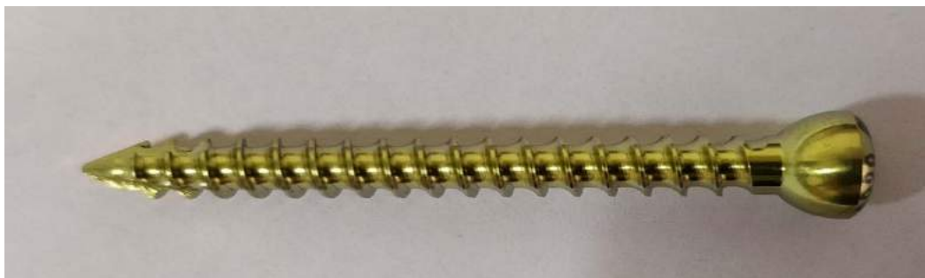
Cat No: 121.016T- 121.016 - 121.060T- 121.060 4.5 mm Cortical screws (TiT/SS)- (16 -60 mm)