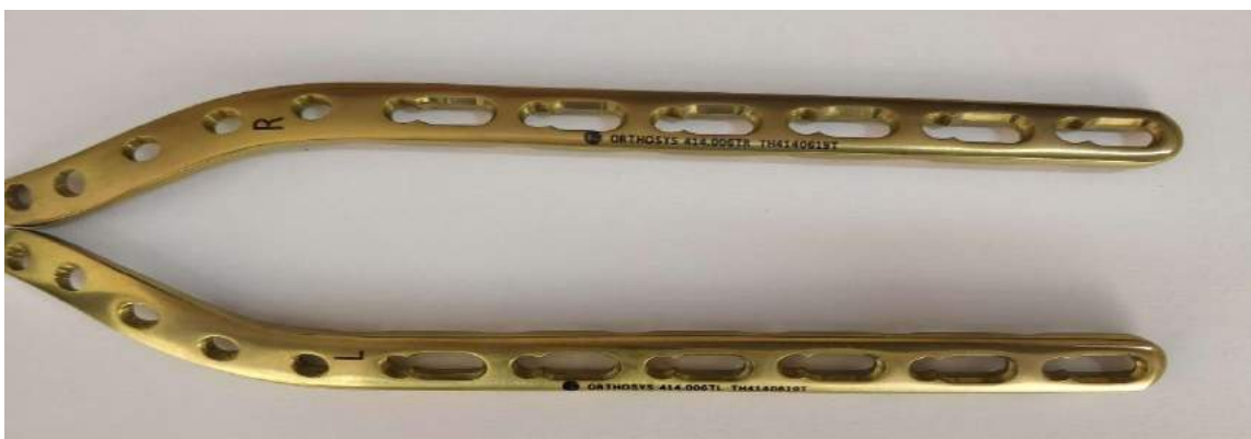
Cat No: 414.004 LT/RT /412.004 L/R - 412.010 LT/RT /412.010 L/R Distal Humerus EA Plate (Left /Right) LCP (TiT/SS - (4 -10 Holes)