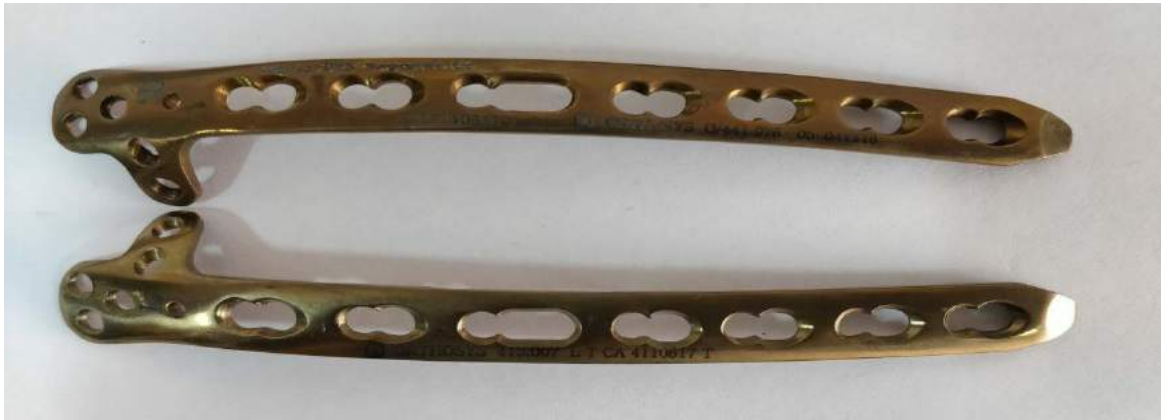
Cat No: 413.003 LT/RT /413.003 L/R - 413.009 LT/RT /413.009 L/R Dorsolateral Plate with Support (Left /Right) 2.7/3.5 mm LCP (TiT/SS)- (3 -9 Holes)