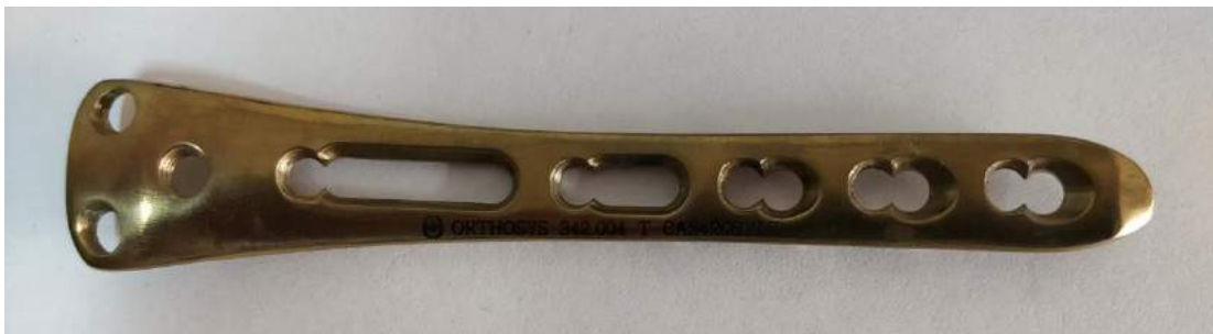
Cat No: 342.002T/342.002 - 342.008T/342.008 Posterior Medial Proximal Tibia Plate 3.5 mm LCP (TiT/SS)- (2 -8 Holes)