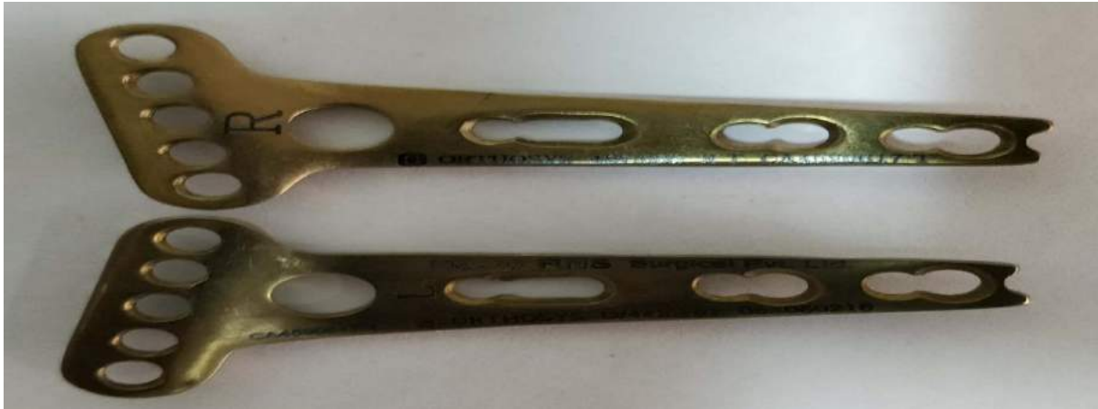
Cat No: 457.003 LT/RT /457.003 L/R Distal Radius Volar Buttress (Left /Right) LCP (Tit/SS) 5 Holes Head- 3 Holes