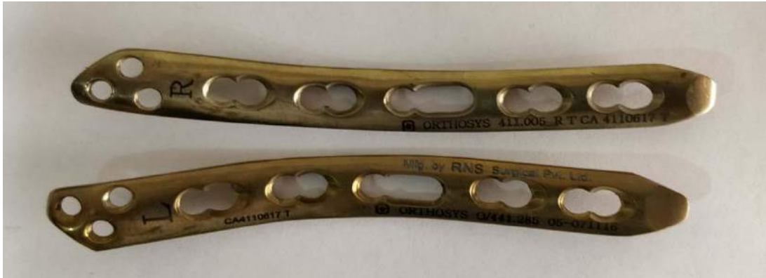
Cat No: 411.003 LT/RT /411.003 L/R - 411.009 LT/RT /411.009 L/R Medial Humerus Plate (Left /Right) 2.7/3.5 mm LCP (TiT/SS)- (3 -9 Holes)