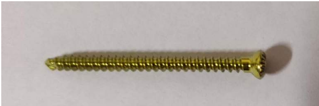
Cat No: 509.010T- 509.010 - 509.040T- 509.040 2.7 mm Cortical Screw (TiT/SS)- (10 -40 mm)