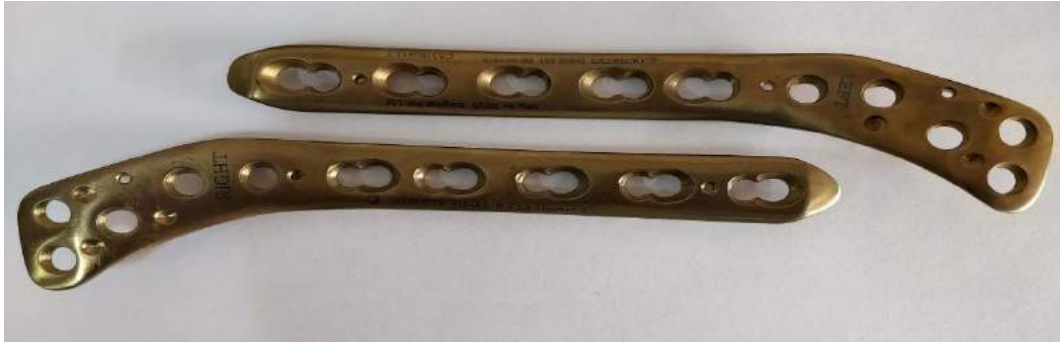
Cat No: 316.004 LT/RT /316.004 L/R - 316.013 LT/RT /316.013 L/R Lateral Tibia Plate (Left /Right) 4.5/5.0 mm LCP (TiT/SS)- (4 -13 Holes)