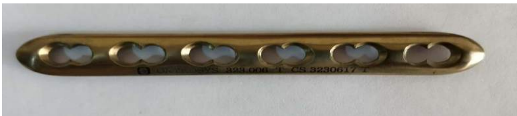
Cat No: 323.005T/323.005 - 323.012T/323.012 1/3 Tubular Plate 3.5 mm LCP (TiT/SS)- (5 -12 Holes)