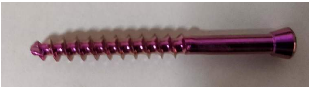
Cat No: 380.045T- 380.045 - 380.095T- 380.095 5.2 mm Cancellous Screw 32 mm TH (TiT/SS)- (45 -95 mm)