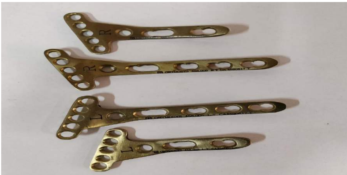
Cat No: 456.003 LT/RT /456.003 L/R - 456.005 LT/RT /456.005 L/R Distal Radius Volar LCP 5 H (Left /Right) 2.7 mm LCP (TiT/SS)- (3 -5 Holes)