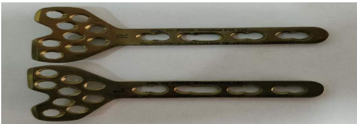
Cat No: 463.003 LT/RT /463.003 L/R - 463.005 LT/RT /463.005 L/R Distal Radius Volar with Column 9 Holes Head (Left /Right) LCP (TiT/SS)- (3 -5 Holes)