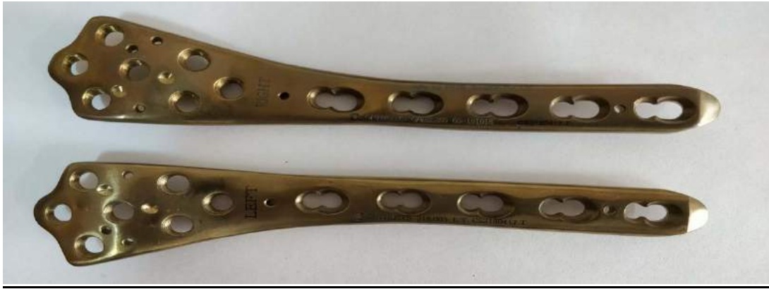
Cat No: 318.005 LT/RT /318.005 L/R - 318.013 LT/RT /318.013 L/R Distal Femur Plate (Left /Right) 4.5/5.0 mm LCP (TiT/SS)- (5 -13 Holes)