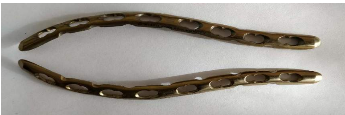
Cat No: 405.006 LT/RT /405.006 L/R - 405.008 LT/RT /405.008 L/R Superior Anterior Clavicle Plate (Left /Right) 3.5 mm LCP (TiT/SS)- (6 -8 Holes)