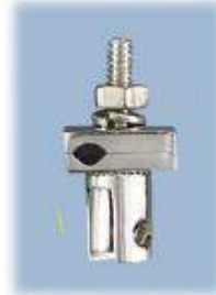
Mini Single Pin Clamp 4.0x4.0mm Cat No. 88.002