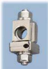
Single Pin Clamp Cat No. 88.005