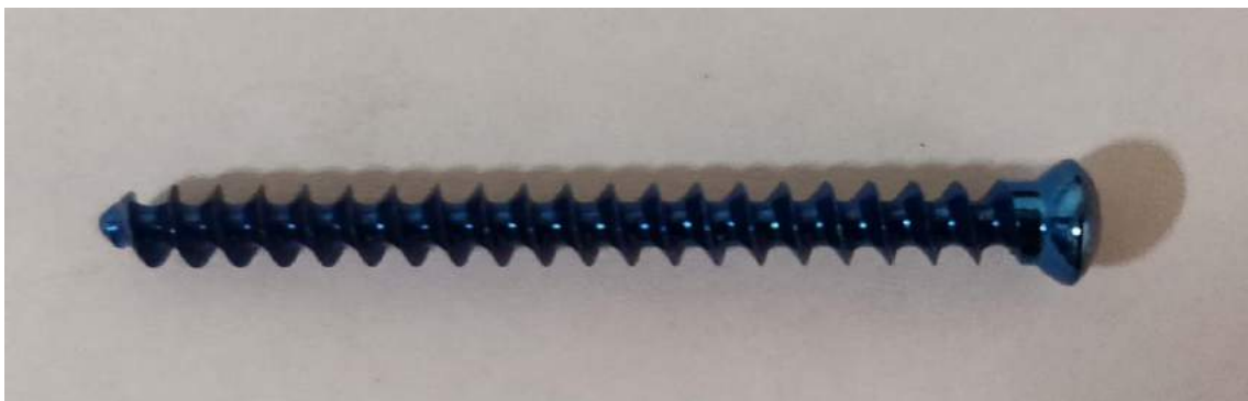
Cat No: 006.020T- 006.020 - 006.060T- 006.060 4.0 mm Cancellous Screw Full Thread (TiT/SS)- (20 -60 mm)