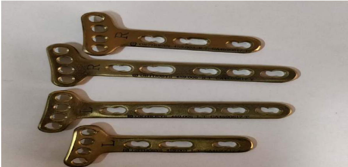
Cat No: 459.003 LT/RT /459.003 L/R - 459.005 LT/RT /459.005 L/R Distal Radius Volar EA 4 H (Left /Right) 2.7 mm LCP (TiT/SS)- (3 -5 Holes)