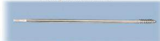
Cancellous Schanz Screw Cat No. 94.065 Sizes : Dia 6.5mm