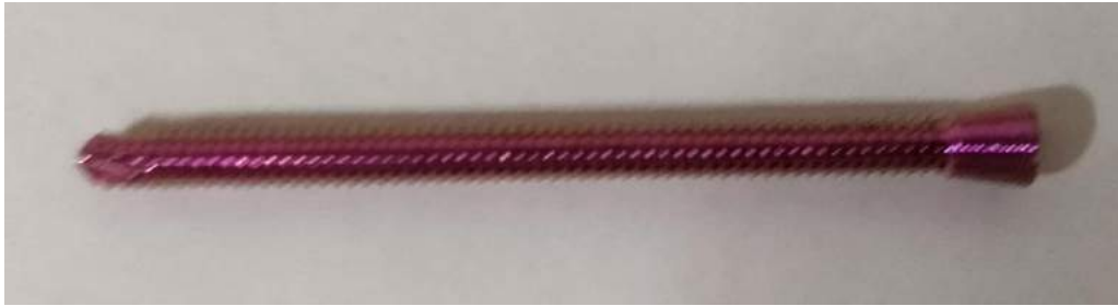
Cat No: 353.012T- 353.012 - 353.060T- 353.060 2.7 mm Locking Head Screw (TiT/SS)- (12 -60 mm)