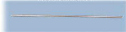
Connecting Rod 4.0mm Cat No. 89.100 to 89.350 Sizes : Length 100 to 350mm (50mm Diff)