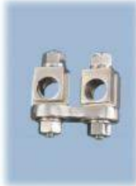
Twin Adjustable Clamp (Straight/Curved) Cat No. 88.009