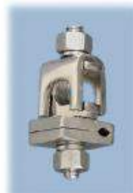
Open Single Pin Clamp Cat No. 88.007