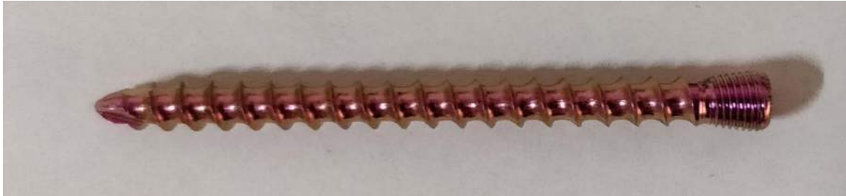
Cat No: 358.020T- 358.020 - 358.060T- 358.060 4.0 mm Canc Locking Head Screw (TiT/SS)- (20 -60 mm)