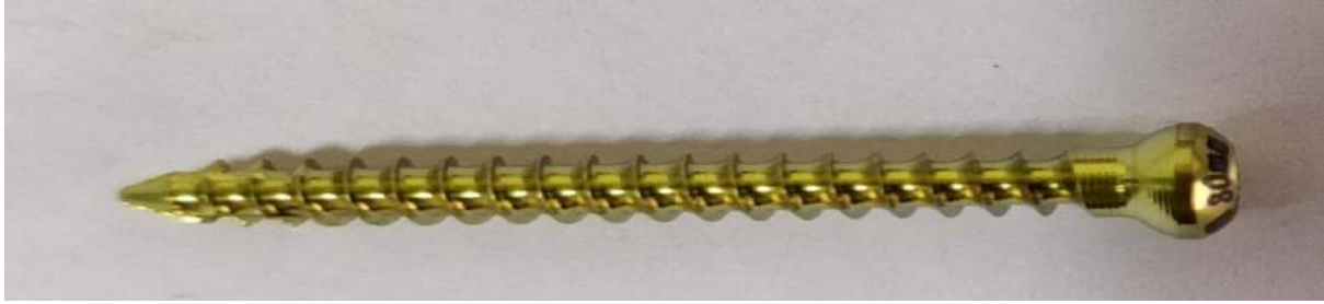
Cat No: 120.012T- 120.012 - 120.060T- 120.060 3.5 mm Cortical Screw (TiT/SS)- (12 -60 mm)