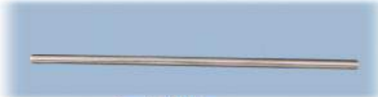
Connecting Rod 5.0mm Cat No. 90.200