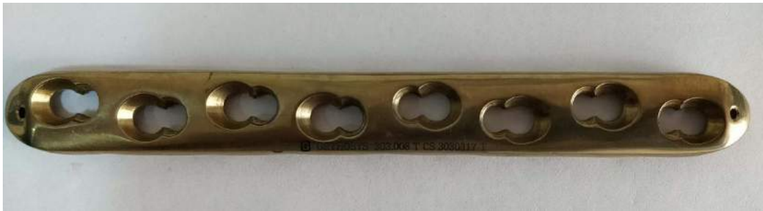
Cat No: 303.006T/303.006 - 303.016T/303.016 Locking Compression Plate 4.5/5.0 mm LCP Broad (TiT/SS)- (6 -16 Holes)