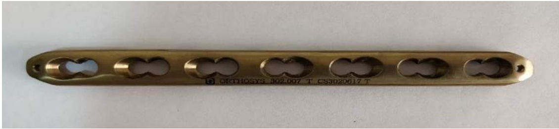
Cat No: 302.006T/302.006 - 302.014T/302.014 Locking Compression Plate 4.5/5.0 mm LCP Narrow (TiT/SS)- (6 -14 Holes)