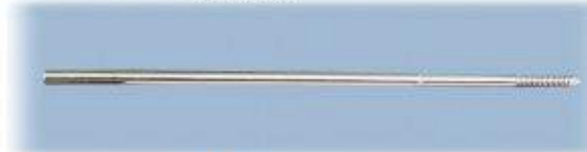
Schanz Screw Cat No. 94.035 Sizes : Shaft Dia 4.0mm, Thread Dia 3.5mm