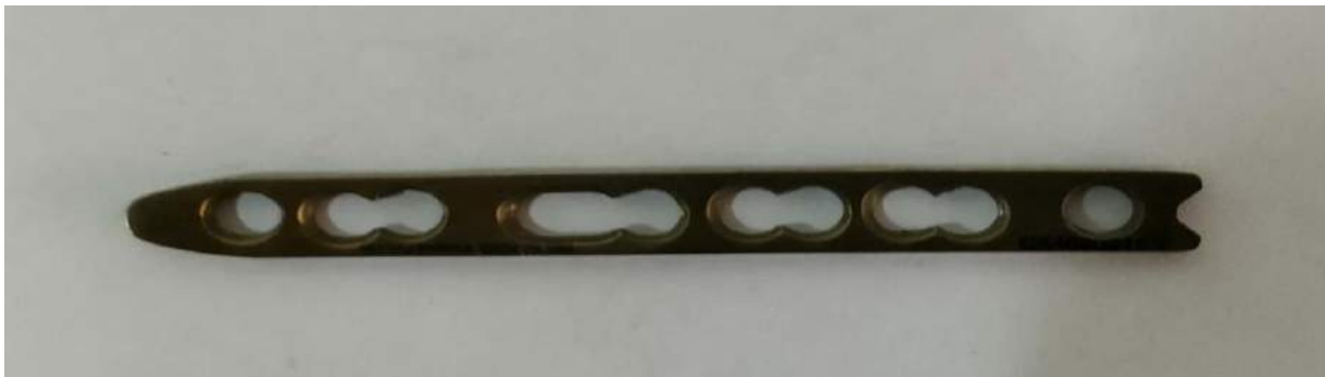
Cat No: 451.005T/451.005 - 451.006 T /451.006 Distal Radius Dorsal 2.7 mm LCP Straight (TiT/SS)- (5 -6 Holes)