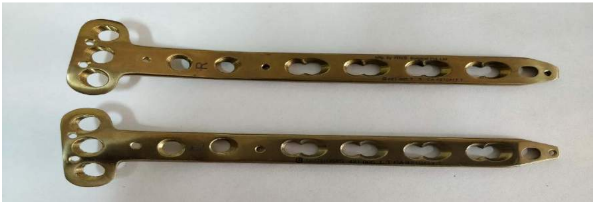
Cat No: 421.004 LT/RT /421.004 L/R - 421.010 LT/RT /421.010 L/R Medial Proximal Tibia Plate (Left /Right) 4.5/5.0 mm LCP (TiT/SS)- (4 -10 Holes)