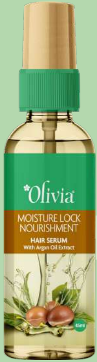
Moisture Lock Nourishment Hair Serum

Enriched with Argan Oil Extract and Vitamin E, this serum instantly adds shine and locks moisture.