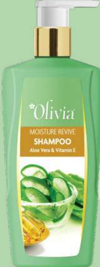
Moisture Revive Shampoo

Here's the perfect shampoo for dry hair! It gently cleanses and delivers an adequate amount of moisture to your hair.