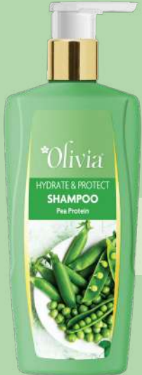
Hydrate & Protect Shampoo

Ideal for dry and damaged hair, this shampoo gently cleanses your hair and smartly balances its moisture levels.