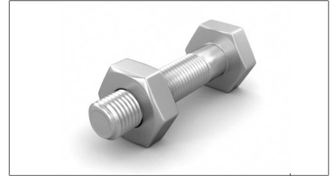
HIGH STRENGTH FRICTION GRIP BOLT (HSFG BOLT & NUT)