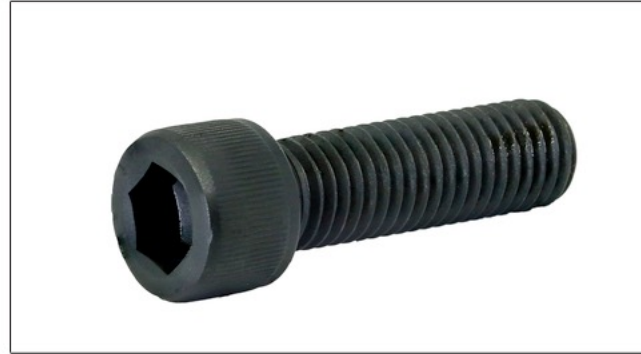
SOCKET HEAD CAP SCREW