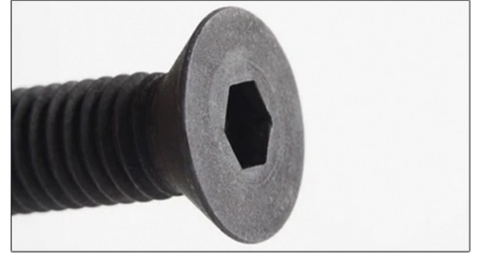
COUNTER SUNK SCREW