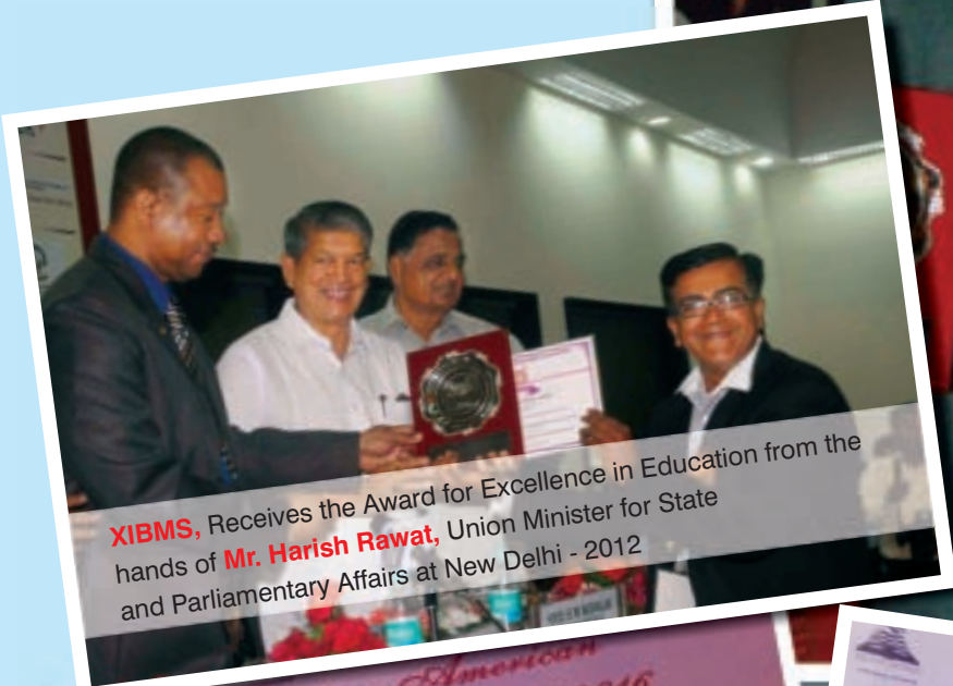
XIBMS, Receives the Award for Excellence in Education from the hands of Mr. Harish Rawat , Union Minister for State and Parliamentary Affairs at New Delhi - 2012