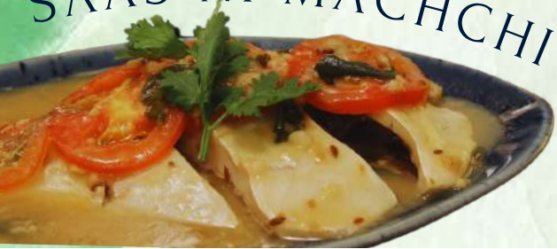
SAAS NI MACHCHI

Prawns cooked in flavourful spicy gravy with hint of coconut. Pairs best with 'Chokha na Rotla'